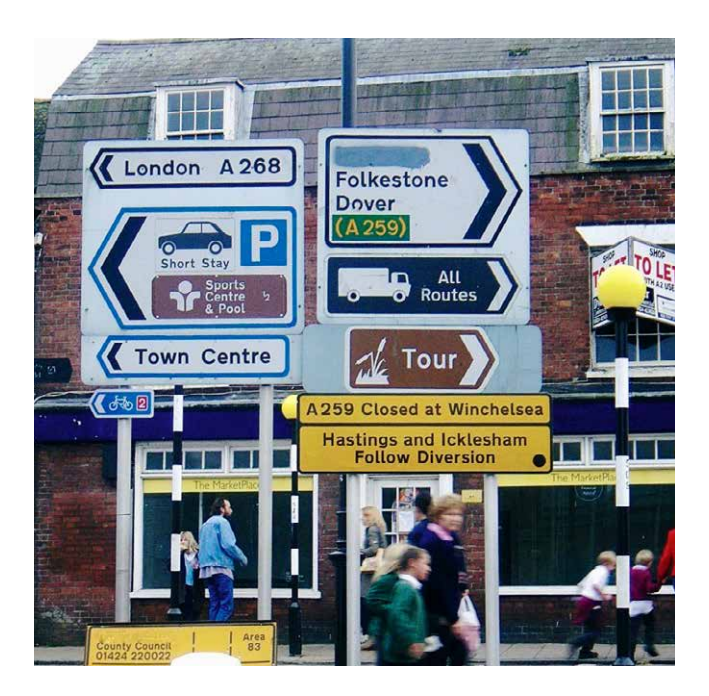
Poorly coordinated signs which are distracting for drivers.