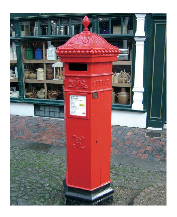
An early Victorian post box, proudly restored. Traditional styles vary and add to local distinctiveness.