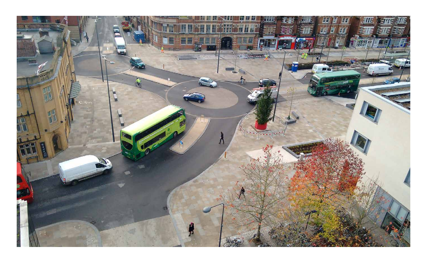
More than 42,000 vehicles, 20,000 pedestrians and 2,500 cyclists pass safely through the new free-flow St Frideswide Square in a normal day.

The new £6.7m road layout has created a welcoming gateway into the city. There are now only two traffic lanes instead of the original six and pedestrians and cyclists have been provided with a much larger and safer public space in which to circulate.