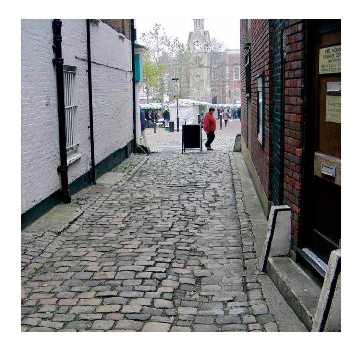
Historic paving often survives in back alleys and adds character.

It begins by identifying the elements that make an area distinctive – its landscape, its building materials and its traditional detailing. It then addresses some of the common problems that can diminish the quality of public areas and explains how integrated townscape management can provide answers.