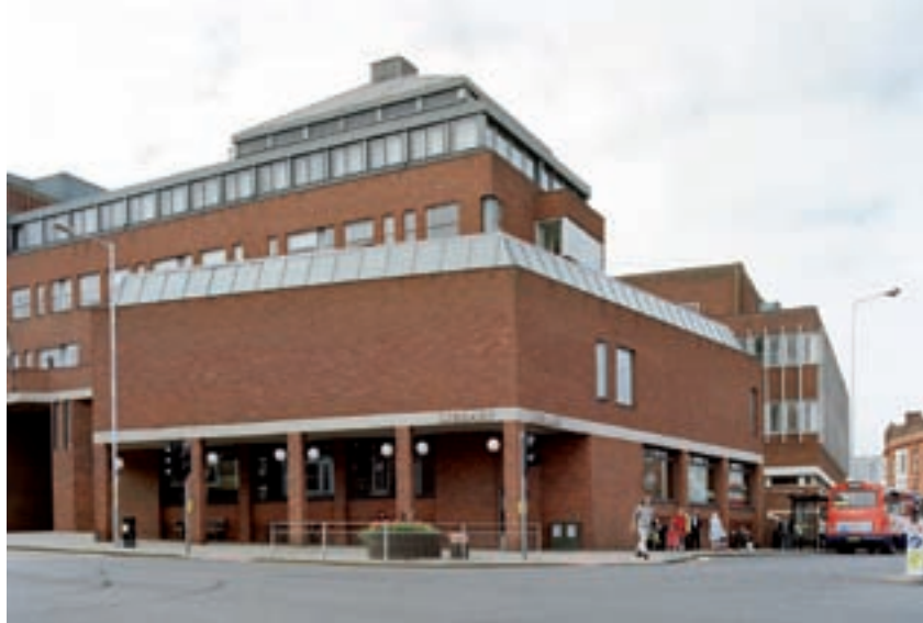
Figure 61 Cecil Square provided entertainment and accommodation for holidaymakers for nearly 200 years; however, the redevelopment of the south-east corner focused on providing services for the local community. The Hippodrome was demolished in 1967 and was replaced by a lending library and local authority offices. [AA050560]

civic centre and its surrounding flower beds and gardens . . . For the first time Margate will have a heart. 18