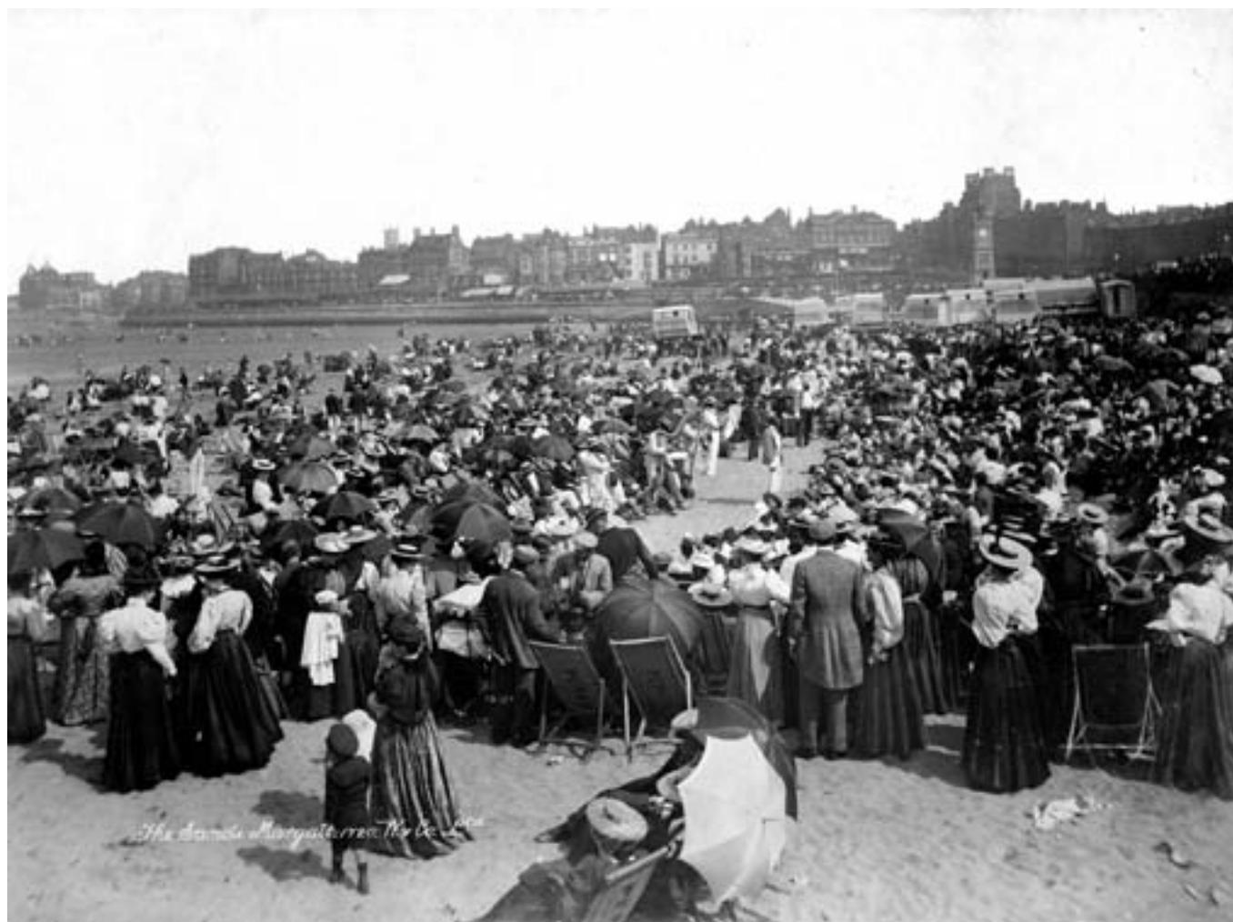
Figure 47 Margate's sandy beach, easily accessible from the railway stations, was often packed with trippers. Here, men, women and children, sporting hats and bonnets, are entertained by a minstrel show. [OP00621]