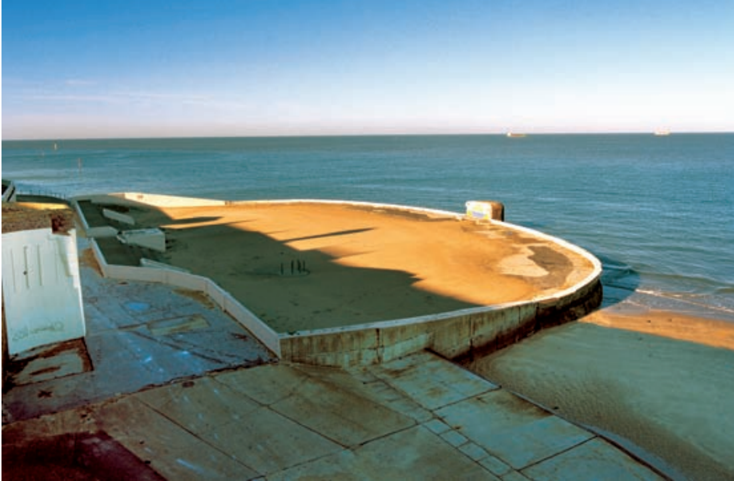
Figure 52 (opposite, top) Viewed from Arlington House, the Scenic Railway and other surviving Dreamland structures now appear rather forsaken within a sea of concrete. [DP032138]