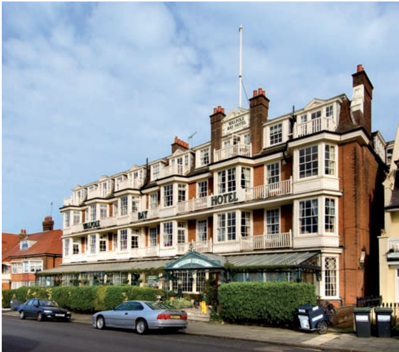
Figure 42 The Walpole Bay Hotel (1914), with its balconies, veranda, and public rooms, continues to offer visitors gracious seaside relaxation in the otherwise vanished tradition of the grand Cliftonville hotels. [DP039334]