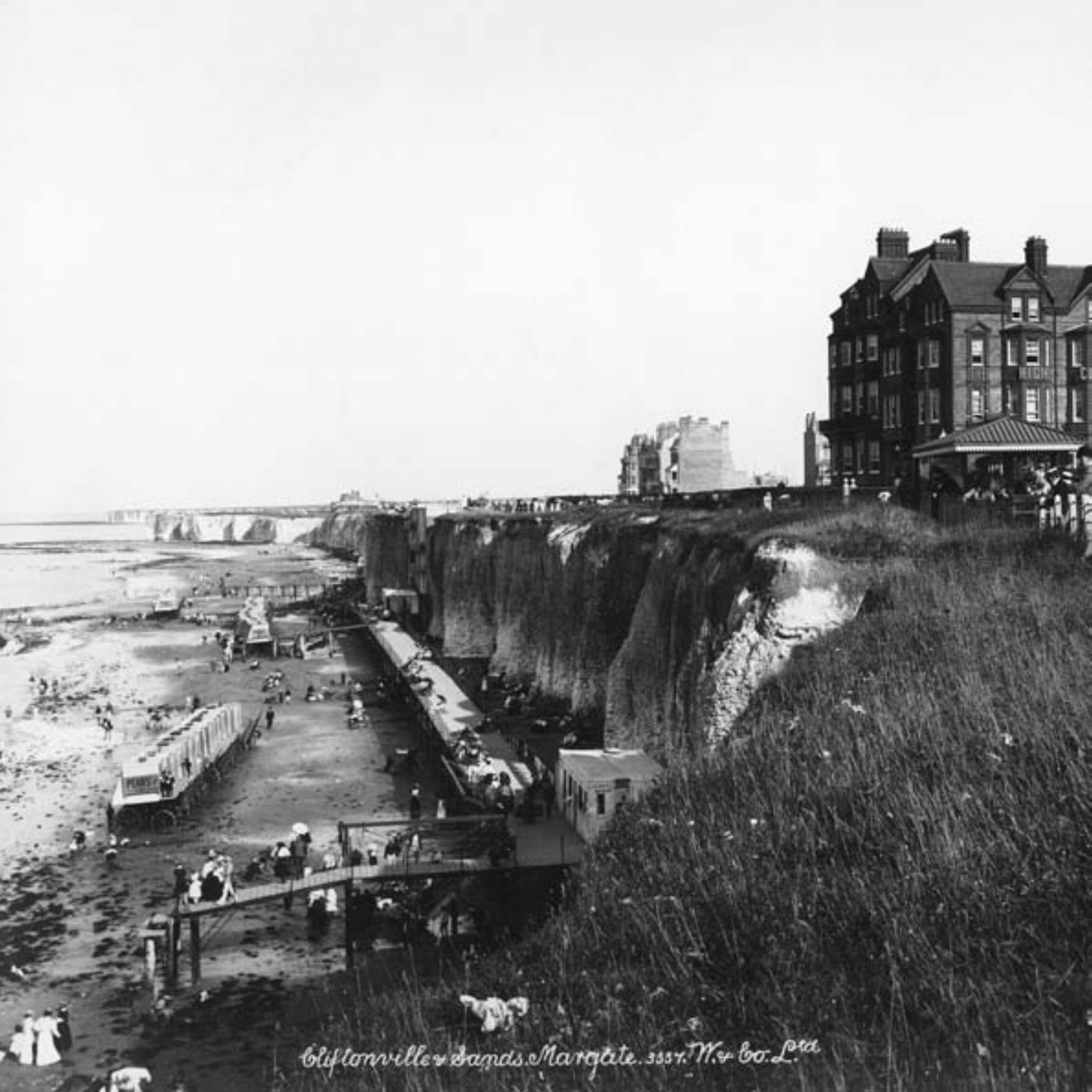
Cliftonville & Sands Margate. 3357. W. & Co. Ltd.