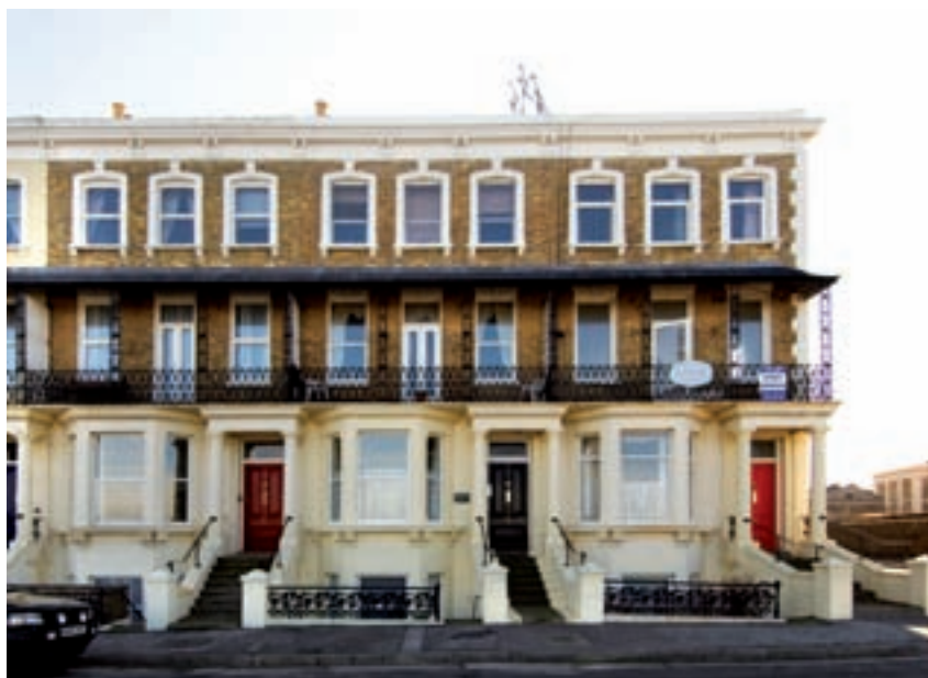
Figure 37 (left) Sea View Terrace, Westbrook , shares many similar features with Ethelbert Crescent – including the form of the top storey and cornice above – suggesting that they could be by the same architect or builder. [DP032160]