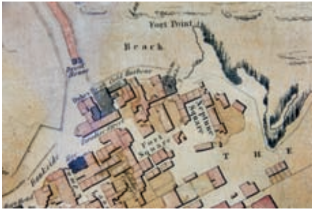
Figure 55 Edmunds' Plan of 1821 shows the area that was cleared as part of the Fort Road Improvement Scheme. [DP032194]