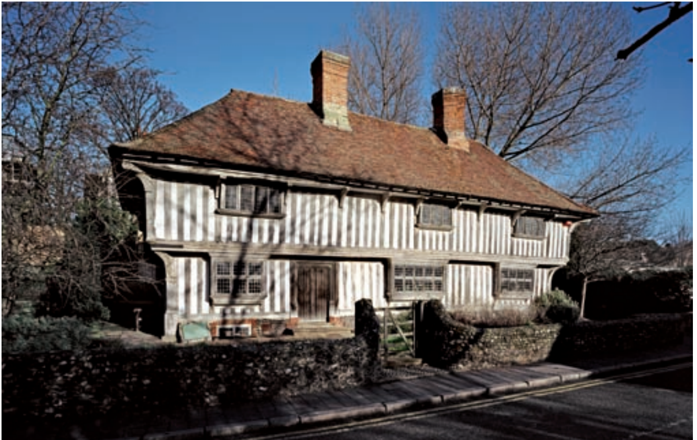
Figure 2 King Street, once a main road to Broadstairs, contains some of the town's oldest surviving dwellings, including Tudor House, a close-studded, continuous jettied, timber-framed house. [AA046458]

John Macky described Margate in the early 18th century as 'a poor pitiful Place' and Lewis described it as 'irregularly built, and the Houses generally old and low'. 3 A handful of buildings survive to provide a glimpse of Margate before its transformation into a resort. The Tudor House in King Street is a 16th-century, timber-framed house, its elaborate form and framing indicating that it was the home of a wealthy citizen (Fig 2). A number of other early timber-framed buildings in King Street appear to have been re-fronted in the 18th century. Other readily