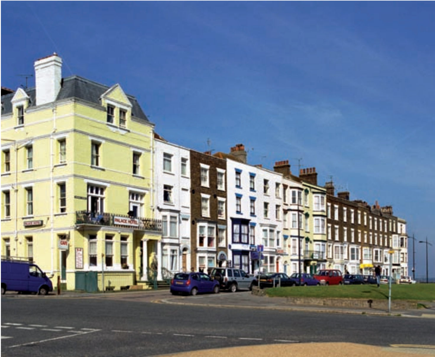
Figure 28 Buenos Ayres was the earliest major terraced house development laid out between the Royal Sea Bathing Hospital and the town. The original Georgian fenestration has been replaced by canted bay windows that rise through two, three or four storeys. [AA049285]