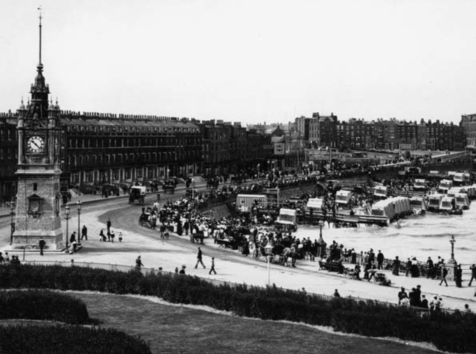
Sea Front Margate...