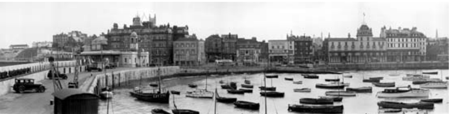
Figures 56 and 57 The 1927 and 2007 views reveal the extent of change over time. Not only have prominent landmarks been lost, the townscape has been altered, particularly as a result of the Fort Road Improvement Scheme on the left. [Courtesy of Adrian Pepin, Media House; DP023151]