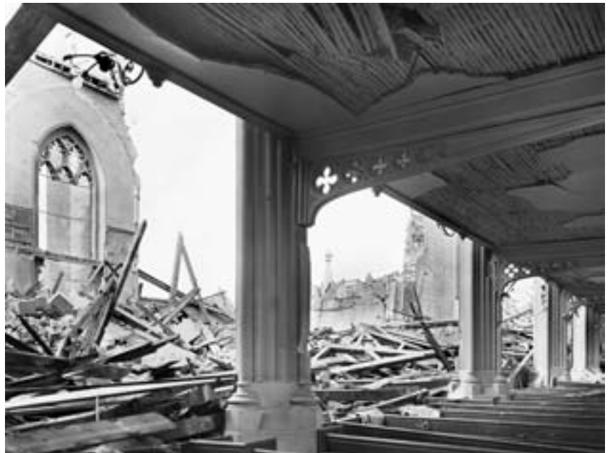
Figure 58 Built as the centrepiece to the Trinity Square residential development, Holy Trinity Church had a 57ft-high (17m-high) nave and a tower that rose to a height of 136ft (41m). This evocative image taken shortly after the air raid of 1 June 1943 shows the extent of the damage. [AA43/07427]

Margate's location made it vulnerable to attack in wartime. During the Second World War more than 2,700 bombs and shells hit the town, destroying 238 buildings and damaging nearly 9,000 others (Fig 58). Perhaps more significant was the damage caused by depopulation. With the threat of invasion, the town's population dropped to around 10,000. An article published in The Times on 31 August 1943 noted that: 'From being a bright and well-kept background to cheerful holidaymaking, Margate has become damaged and shabby . . .'. 16 Before the war there were 30 first-class hotels, 60 smaller hotels, 150 private hotels, 1,300 boarding houses, 1,500 apartment houses and 3,500 private dwellings that took in visitors. In August 1943 there were just two hotels and a handful of boarding houses.