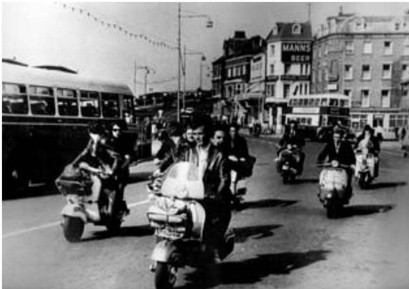
Figure 65 Taken on Whitsun Bank Holiday 1964, this amateur photograph captures a group of scooter-riding Mods on The Parade. Following national coverage of the trouble between Mods and Rockers, the Mayor of Margate was less than impressed with the adverse publicity: 'We in seaside resorts have a difficult enough job to make a living in the short English summer, and the sort of publicity we get from activities of these morons as glamorized in the national press and on television does us no good at all.' (The Times, Wednesday, 20 May 1964) [Unpublished amateur photograph]