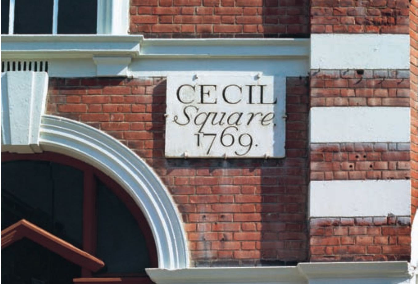
Figure 12 A plaque attached to Stockwell House at the north-east corner of Cecil Square celebrates the date of this important seaside development. [AA049251]

guidebook of 1770 noted that building work was still in progress. The new square contained large houses built for fashionable families, a row of shops, and the purpose-built Assembly Rooms and circulating library that had been erected beside Fox's Tavern (Figs 13, 14 and 15). Hawley Square was created by Sir Henry Hawley soon after Cecil Square (Fig 16). Building work may have begun in the 1770s, but the library in the north-west corner and the theatre in the north-east corner were built in 1786 and 1787 respectively, suggesting that most building work on the square dated from the 1780s (Fig 17).