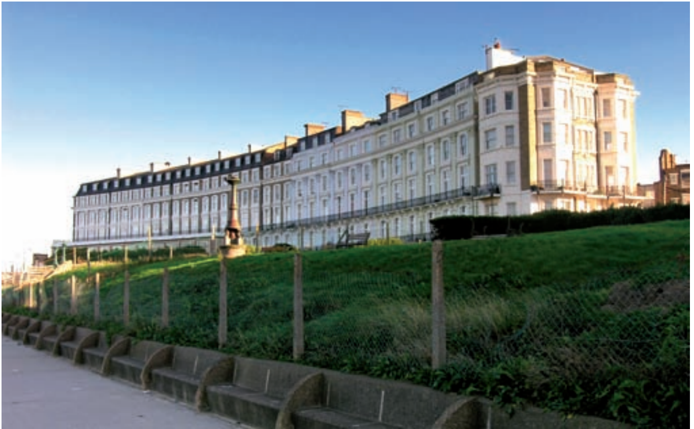
Figure 35 The large houses of Royal Crescent still retain much of their elegant exposed brickwork with elaborate stucco detail. [DP023147]

Cliftonville's first development on a grand scale was Ethelbert Crescent in the 1860s with the Cliftonville Hotel as its centrepiece (Fig 36). It continued the Italianate theme, but with the addition of alternating Ionic porches and bays on the ground floor supporting undulating iron balconies. Sea View Terrace in Westbrook (before 1874) is a simplified version, with three rather than four storeys, Doric porches, and a veranda running the length of the terrace (Fig 37).