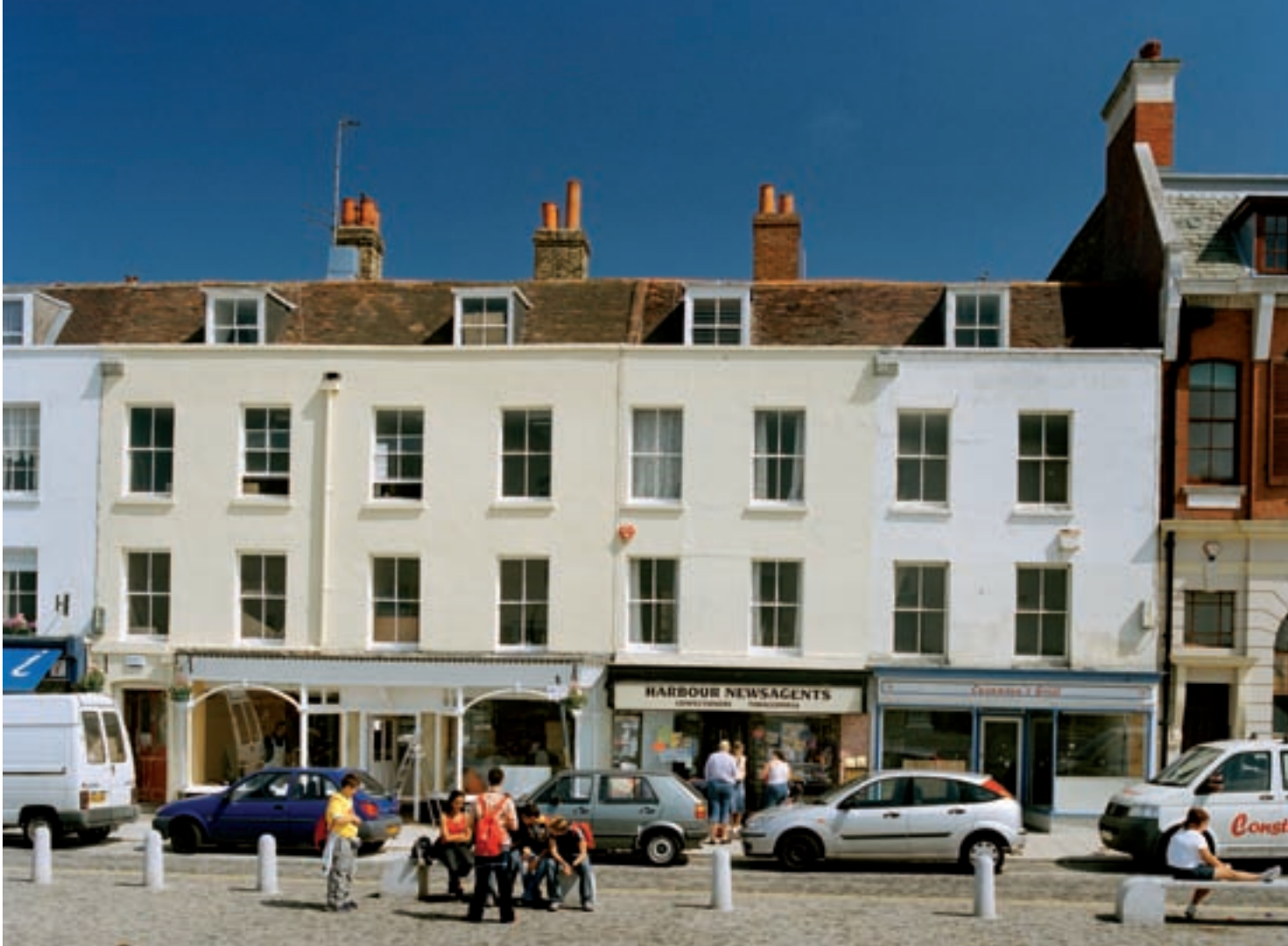
Figure 70 These refurbished Georgian buildings on the Parade are providing high-quality accommodation for businesses, including a café with seating in the summer on the paved terrace in front. [AA050540]

Reviving the old town as a distinctive arts and cultural quarter, and using the intimate scale of the historic buildings as an attraction for new businesses, could once again allow the heart of the Margate to thrive (Fig 70). The first new businesses are already appearing in refurbished buildings and a former Lloyds Bank in King Street has been converted into the Margate Media Centre, providing a base for media-related companies seeking office accommodation.