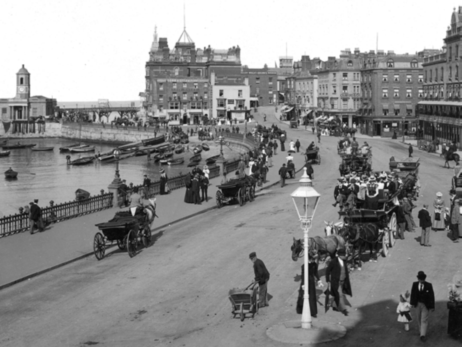
Margate Parade. 3323.