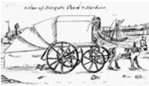
Figure 5 The antiquarian Joseph Ames inserted this drawing into a copy of Reverend Lewis's book, which he deposited in the Society of Antiquaries in the 1750s. It is the earliest depiction of a bathing machine with modesty hood and the first description of how 'bathing waggons' operated. [DP017642 Society of Antiquaries of London]

Margate also has a special place in the history of another key feature of the seaside: the bathing machine. This mobile changing room was used to take people out into the sea, and once suitably immersed the bathers would 'enjoy' a dip, sometimes with a guide to help them. The first reference to a primitive version of these contraptions dates from the 1720s and an engraving of Scarborough of 1735 provides the earliest depiction of one. At Margate Zechariah Brazier was said to have been the first guide to have taken a bather into the sea in a 'simple machine, a cart'. 5 However, the key event occurred in 1753, when Benjamin Beale invented the modesty hood. This canvas canopy could be lowered and raised by the driver of the machine, allowing bathers a modicum of privacy as well as some protection from wind and waves (Fig 5).