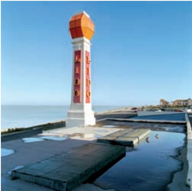
Figure 69 The illuminated beacon for Margate Lido cunningly utilised the surviving chimney from the 19th-century Clifton Baths. [AA046224]