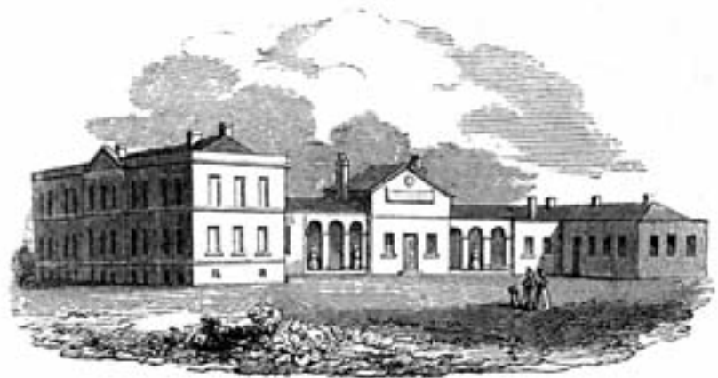
Figure 22 This view of the Royal Sea Bathing Hospital in 1831 shows the early 19th-century additions to the north and south, which enabled it to accommodate over 200 patients. [DP017648 Society of Antiquaries of London, from Kidd 1831]

The hospital grew rapidly during the 19th century, so that at the 1841 census it was treating 214 patients (Fig 22). Indoor baths containing salt-water were established in 1858, replacing sea bathing and allowing year-round treatment. In 1910 the swimming bath was converted into a ward, marking the end of bathing in water as a means to cure patients. The hospital became part of the National Health Service on 4 July 1948, and continued in use until its closure in July 1996 (Fig 23). The buildings are being converted into luxury apartments ( see Fig 68).