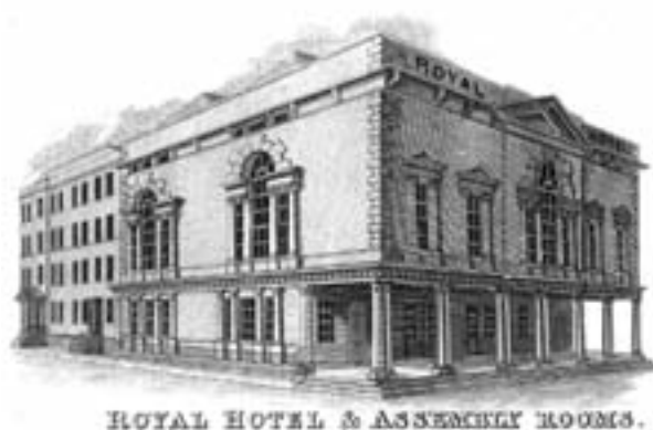
Figure 14 (left) Royal Hotel and Assembly Rooms in c1827. From the early development of Cecil Square until the demolition of The Hippodrome, the south-eastern corner of the square was the site of leisure and entertainment facilities in Margate. The Assembly Room on the first floor is demarcated by the double-height Venetian windows.