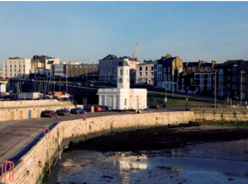
Figure 67 (left) The Droit House was destroyed during the Second World War, but was reconstructed in 1947. The site adjacent to the Droit House may become the venue for Margate's new art gallery, the Turner Contemporary. [DP032201]