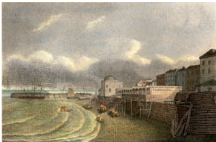
Figure 6 The rebuilt High Street bathing rooms, with their perilous stairs down to the sea, are clearly shown in this engraving of 1812. The return elevation of Philpot's establishment advertises 'warm salt water baths and machines for bathing'. [DP022308]

Other developments in the third quarter of the 18th century demonstrate how Margate was being transformed into a resort. To cater for visitors, claimed a guidebook, 'Some good Houses have been built within a few years, and others are building: The old ones daily receive all the improvements they are capable of.' 6 This was a response to the