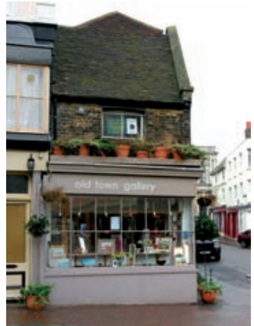
Figure 66 (above) The Old Town Gallery, located in a Grade II mid-19th-century building in Broad Street, suggests how the association with JMW Turner can be used to revitalise the old town. [DP023150]

In 1994 the idea of a gallery to celebrate Turner's work was first proposed. It would also stage exhibitions by other artists connected with Kent, as well as shows featuring works by contemporary artists. A site beside the Droit House was identified and in 2003 a high-profile competition was won by Snøhetta and Spence Associates for a striking building adjacent to the stone pier, though technical difficulties with this scheme mean that a new design is currently being developed by David Chipperfield Architects (Fig 67). Although a building has not