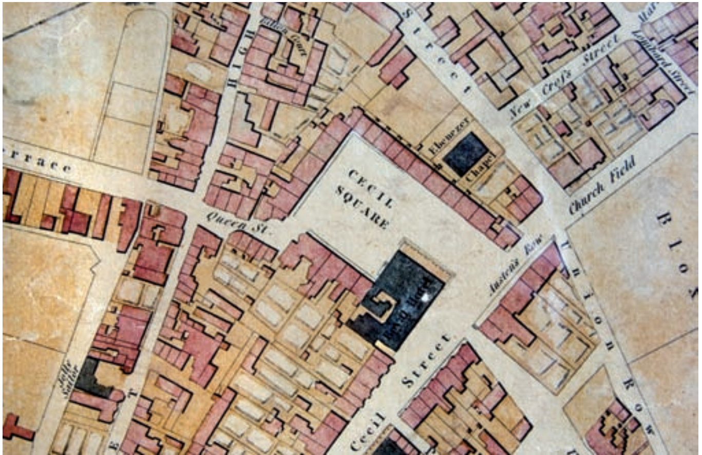
Figure 15 Edmunds' Plan shows that Cecil Square had been completed by 1821. Far from being a secluded residential development, Cecil Square was also a transport hub connecting the old town with new developments on the coast.