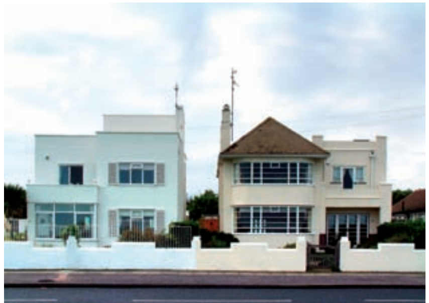
Figure 48 These two houses in Palm Bay Avenue are good examples of the types of modernist houses that were built on seafront roads in many resorts during the 1930s. [DP023149]

In the early 20th century Margate offered a range of modern facilities. The most successful entertainment building was arguably