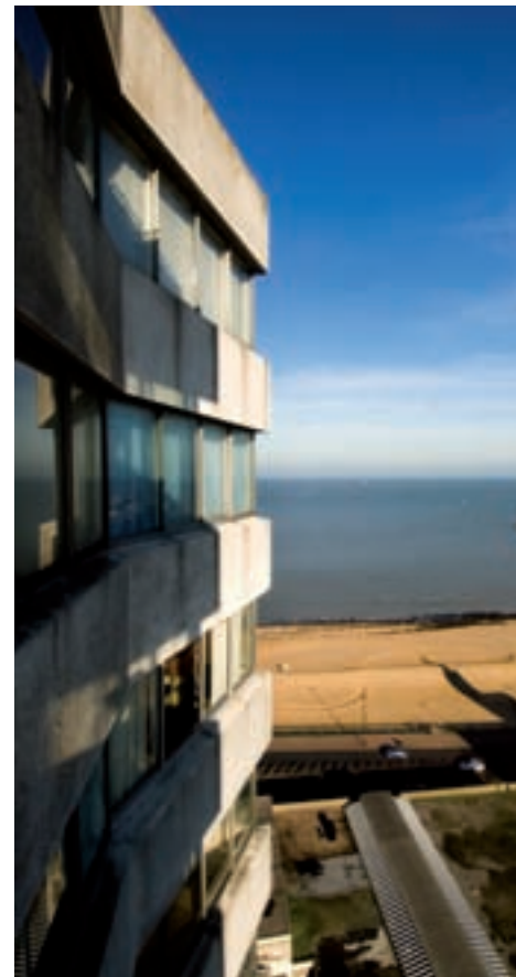
Figure 60 Arlington House's zig-zag elevations create a sort of internal balcony, which not only enhance the views from the flats, but also create a sensation of projecting out from the building. [DP032144]

roads and car parking were needed, but to achieve this the local authority was prepared to forfeit some of its most important heritage. One of the car parks would have covered the Market Place and most of the old town, demonstrating that it was seen as having no relevance to the future of Margate. A purpose-built civic centre and a pedestrianised shopping area were to be provided on the south side of Cecil Square. The 1965 report boasted that: