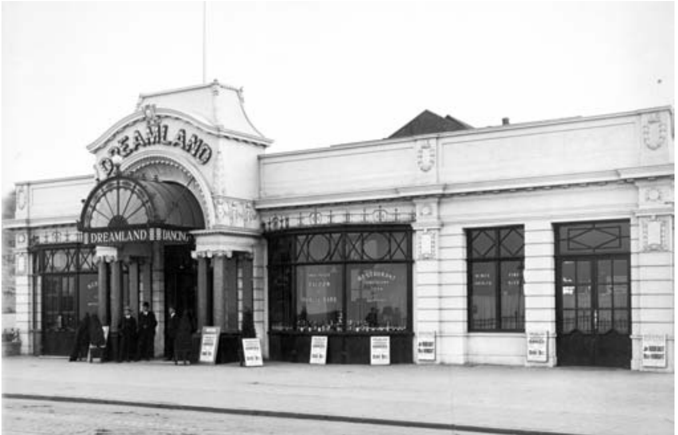
Figure 46 This photograph of the florid fin-de-siècle rebuilding of the Hall by the Sea was taken soon after it was renamed Dreamland in 1920. [BB84/00899]

Visitors also flocked in increasing numbers to the beaches, promenades and gardens. Minstrel troupes, such as Uncle Bones', entertained visitors on the sands (Fig 47). By the end of the 1890s, there were bandstands at the Fort, on the Jetty, and in Dane Park. Cafés, restaurants, shops and hotels lined the seafront, and the High Street was teeming with trippers. A guidebook of 1899–1900 considered that 'If, sometimes, the fun is a little noisy, perhaps even a trifle vulgar, who, after all, is the worse for it?' 14 Margate had long been christened 'Merry' in the press, with a reputation for the vulgarity of its lower-class patrons, but as the guidebook rightly claimed: 'there are at least two Margates, and that the Cliftonville and New Town quarters have scarcely anything in common with the regions sacred to the tripper.' 15