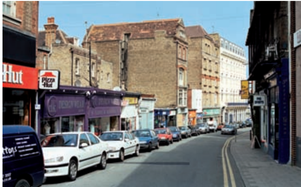
Figures 7 and 8 These images of the High Street reveal the evolution of the area before and after the erection of buildings on Marine Drive. The low-level form of the bathing rooms can still be seen in their later replacements. However, the tall buildings constructed on Marine Drive block the views that were previously enjoyed from the balconied houses on the east side of the High Street. [BB67/08933; AA046470]

growing number of wealthy visitors who were seeking more comfortable and more fashionable lodgings. By 1770 a later edition of the same guidebook could claim that 'There are several good Lodging-houses, and their Rooms, though frequently small, are neat. They may be said to be commodious too, if it is considered that many are now applied to a Use for which they were not originally intended. However, many have been built of late Years, expressly with an Intention of their being hired for Lodgings'. 7