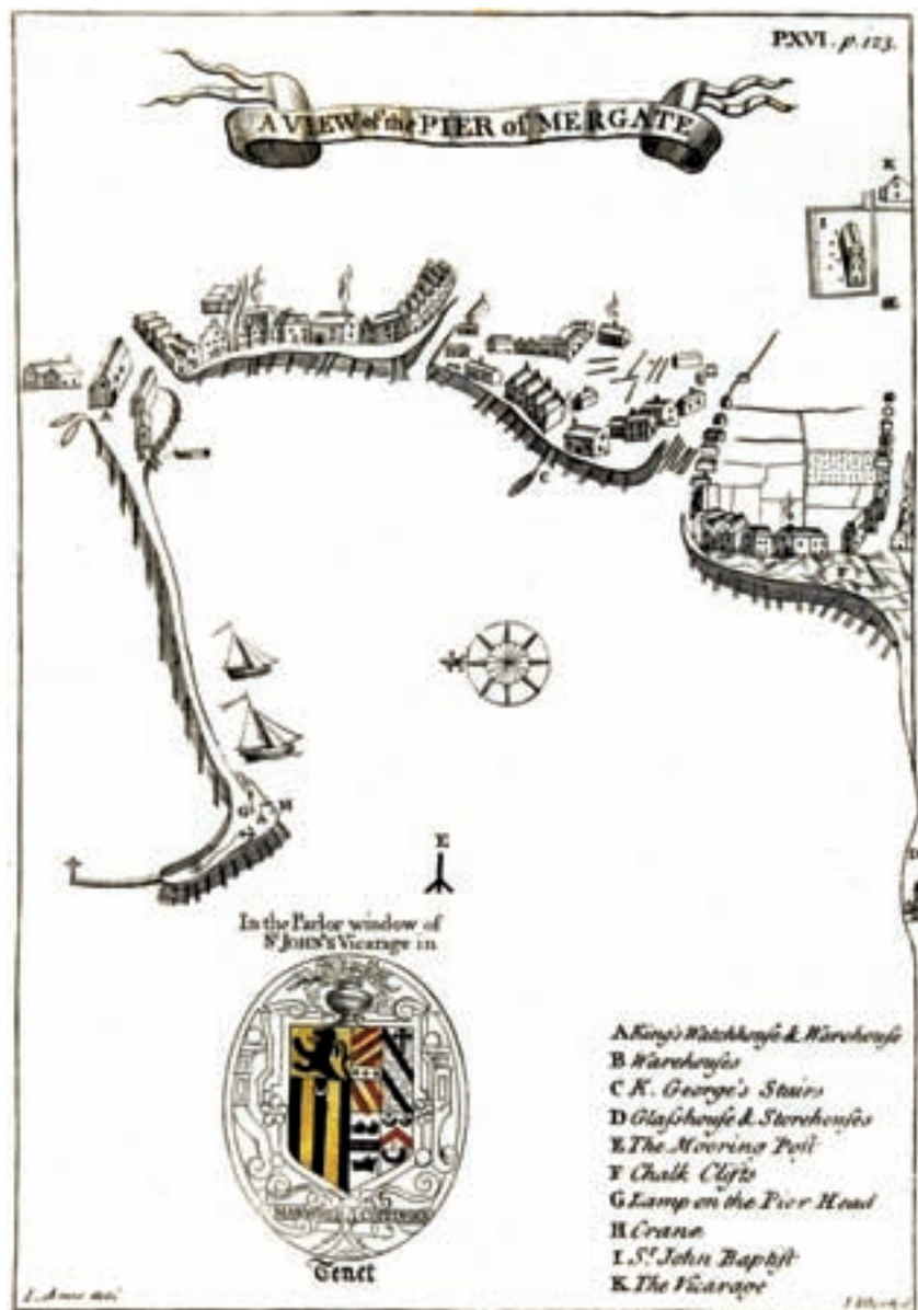
Figure 1 This view from Lewis's book reveals how in c1736 Margate was clustered around the pier, its major source of wealth. There is no hint of the fledgling resort activities that would alter the town over the ensuing 250 years. [DP017639 Society of Antiquaries of London]