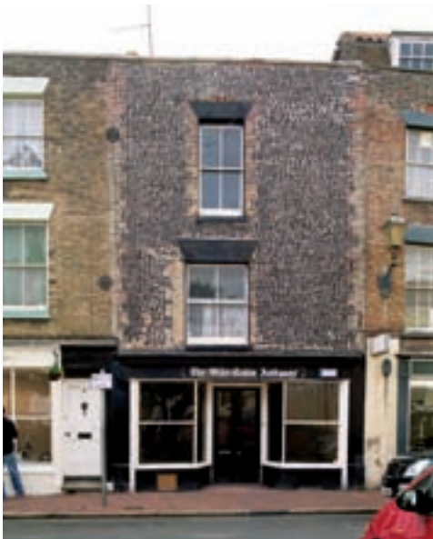
Figure 10 (below, right) India House, 12 Hawley Street. One of Margate's more remarkable houses, India House contrasts sharply with the form and style of dwellings constructed in nearby Cecil Square and Hawley Square, suggesting it was intended as a family home rather than a house that could be let as lodgings for visitors. [AA050169]