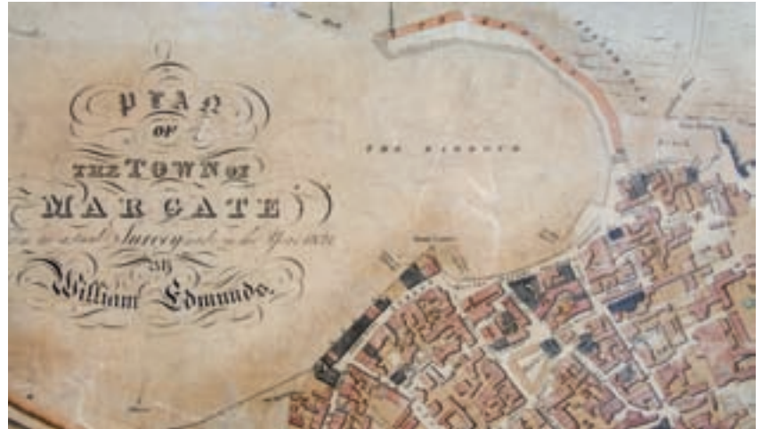
Figure 26 The harbour pier is approximately 900ft long, 60ft wide and 26ft high (274m long, 18m wide, 8m high) and is built of roughly dressed stone. Margate's pier was essential to its development as a seaside resort and though it is now used by fewer boats, it still remains a significant presence on the seafront. [DP032181]

Figure 25 Edmunds' 1821 plan shows the recently rebuilt harbour pier. The outer edge of the pier was raised to form a fashionable promenade above the harbourside where ships were landing passengers and cargo. [DP032184]