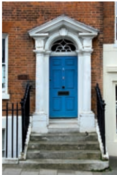
Figure 31 (far right) Rusticated doorcase, Union Crescent. This example reflects a simplified version of the elaborate vermiculated surrounds used in Bedford Square, London (1776–86) . [DP026088]