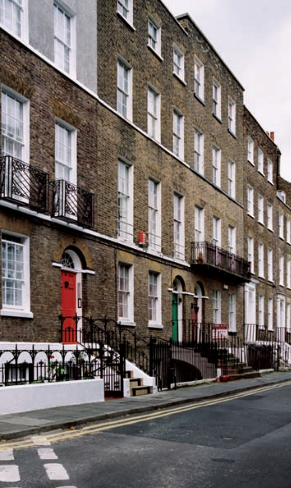
Figure 18 Houses on the south side of Hawley Square. Despite the general uniformity of many of the houses built here, the piecemeal development can be clearly discerned by the differing storey levels and phase joints between houses. [AA050144]