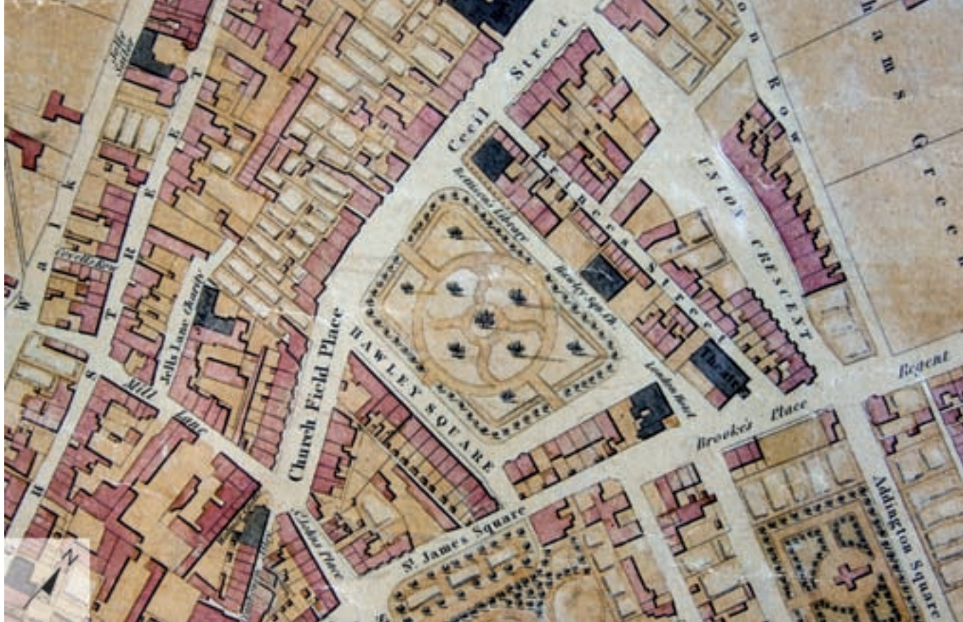
Figure 16 (above) Unlike Cecil Square, Hawley Square was built around an enclosed 'pleasure ground' garden. In 1800 the square comprised 'an entire range of genteel houses from one end of it to the other, most of which command a fine and extensive prospect over the sea'. [DP032187 Courtesy of Margate Museum, from Edmunds' Plan]