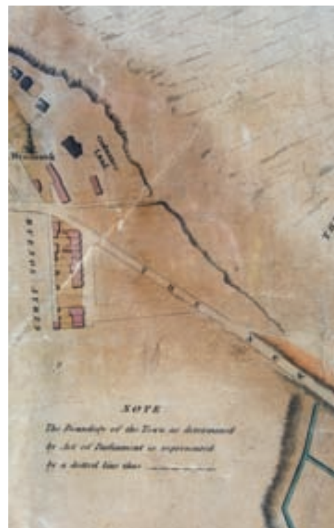
Figure 27 Edmunds' 1821 plan reveals that, despite having been started in 1803, Buenos Ayres had not been completed nearly twenty years later, with space for another two houses still remaining. [DP032183]

Margate's population rose by 65 per cent between 1801 and 1821, from 4,766 to 7,843. In the same period England's population increased by 35 per cent and Kent's by 37 per cent. Although Margate was relatively small in 1801, its rate of growth was still impressive. In 1800, development was concentrated near the heart of the original town, but by the early 19th century a fundamental shift in this pattern was taking place. Edmunds' map of 1821 demonstrates that new developments were being erected on previously undeveloped land along the coast on either side of the historic town. Buenos Ayres, a terrace of 13 houses, was begun in 1803 to the west of the town (Figs 27 and 28). 'The New Road', now