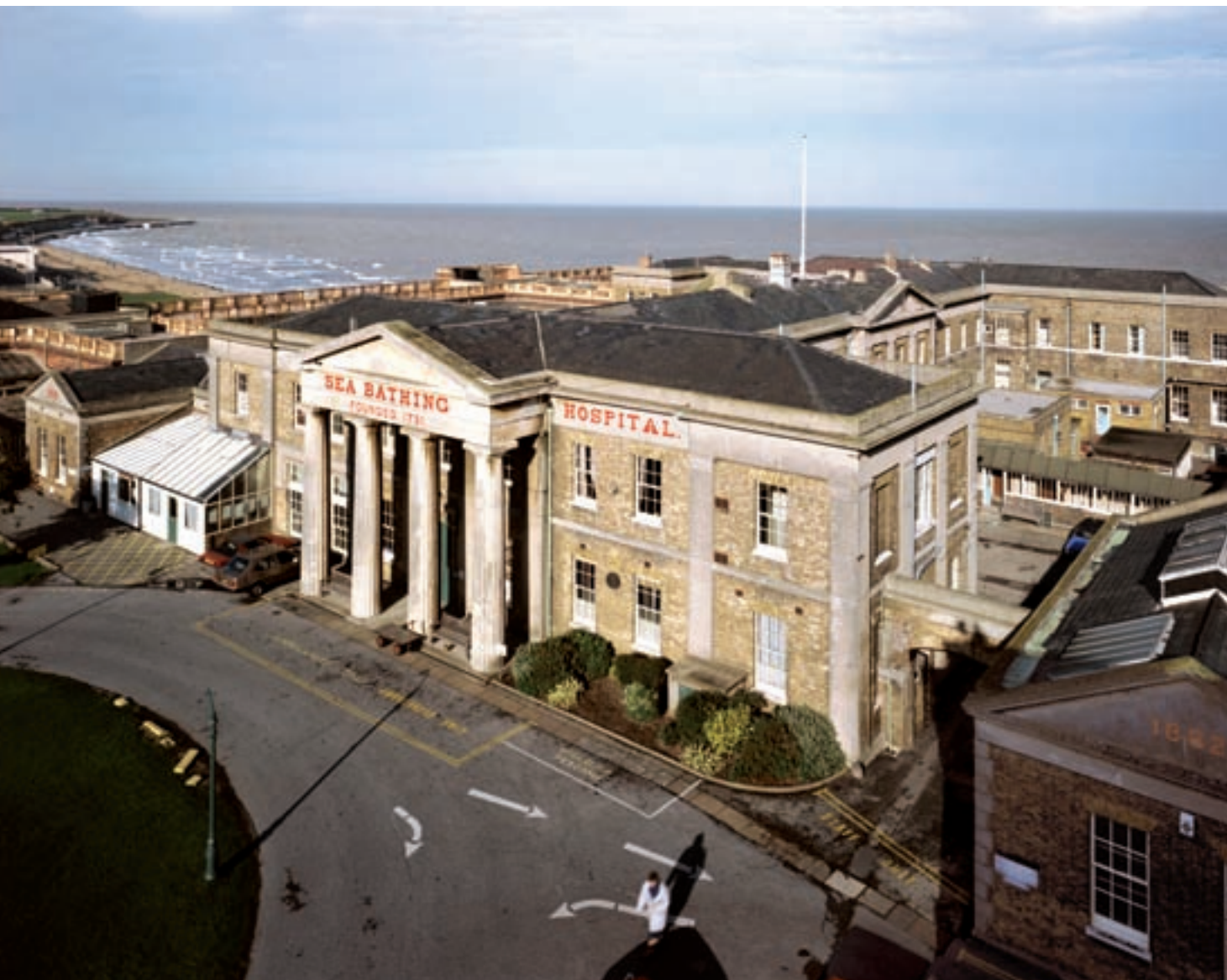
Figure 23 Taken from the top of the former nurses' home, this view gives an impression of the extensive development of the Royal Sea Bathing Hospital site immediately before it closed in July 1996. [BB91/21379]