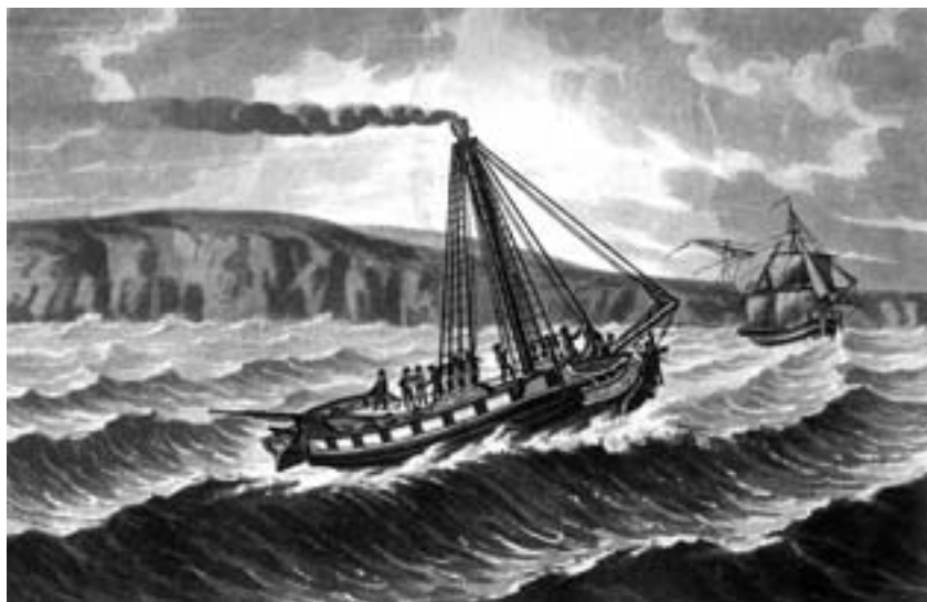
Figure 24 The Steam Yacht 'The Thames' began a regular service between London and Margate in 1815.

Margate's pier was essential to the town's success. The Improvement Act of 1787 contained a provision for rebuilding the pier in stone, though a guidebook in 1809 still referred to it as being wooden, as if the early structure had just been clad in stone. The 1808 storm caused severe damage and it was rebuilt between 1810 and 1815, though large numbers of people still arrived by sea during this hiatus. The pier is approximately 900ft long (274m) and is roughly half-octagonal in plan (Figs 25 and 26). Initially this renewed structure still had to deal with passengers and cargo, but in 1824 Jarvis' Jetty, a 1,186ft-long (356m) wooden structure was added to the east of the pier, its length allowing passengers to land irrespective of the state of the tide. At Margate new 'piers' added in the 19th century bore the name 'jetty' to avoid confusion with the harbour's stone pier.