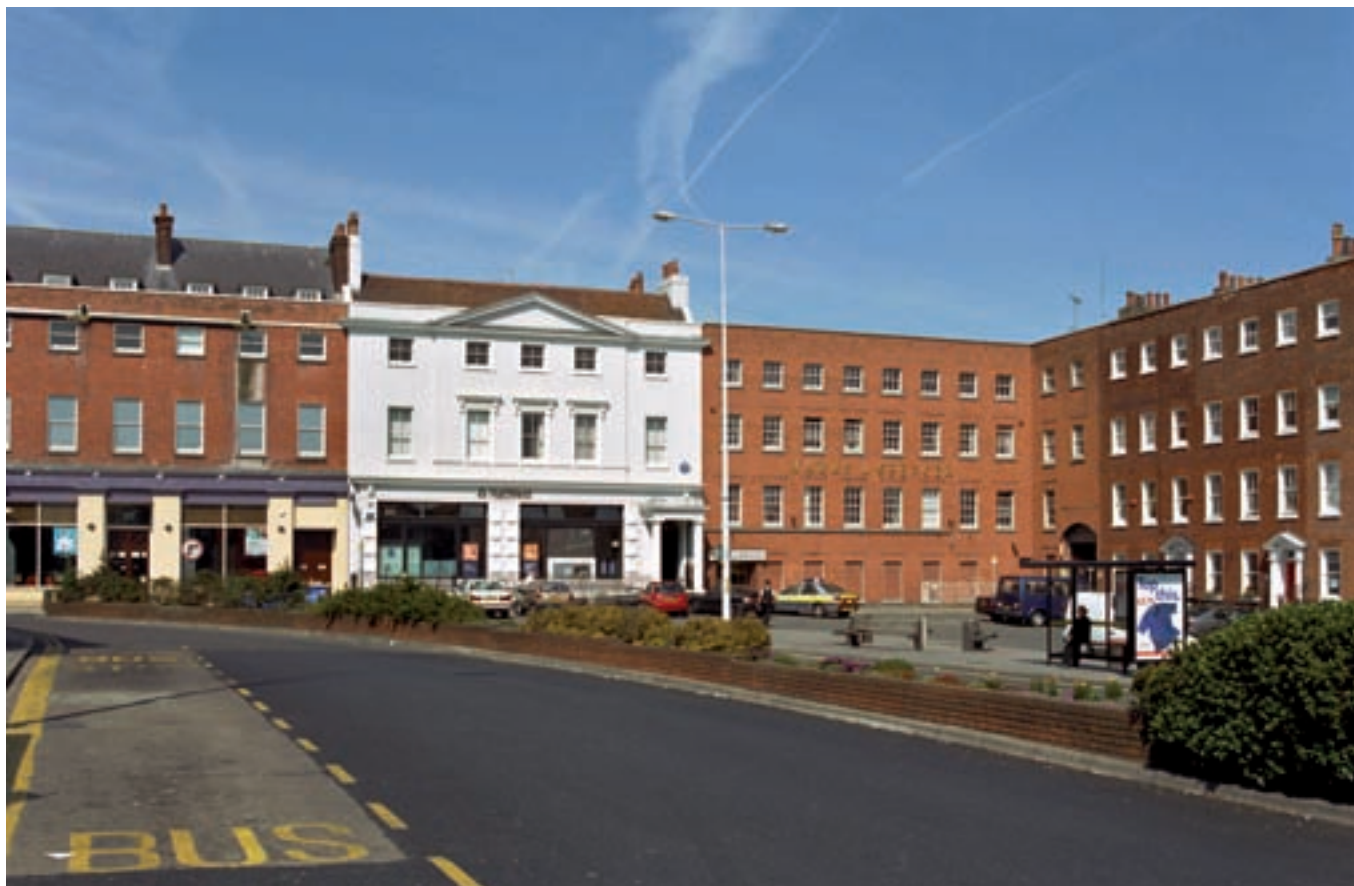
Figure 13 (above) Cecil Square was a residential, commercial and entertainment centre for the wealthy visitors of a new seaside resort. The square has always been a busy traffic hub, but it is now entirely occupied by a car park and the main road. [AA049298]