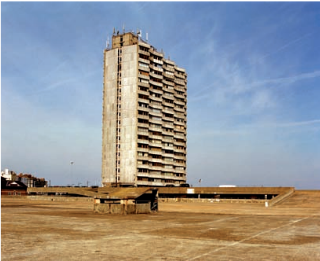
Figure 59 There is great affection towards Arlington House from some of those closely associated with it, though the same cannot be said of the near-derelict retail square to the east and the car park to the south of the flats. [AA050590]