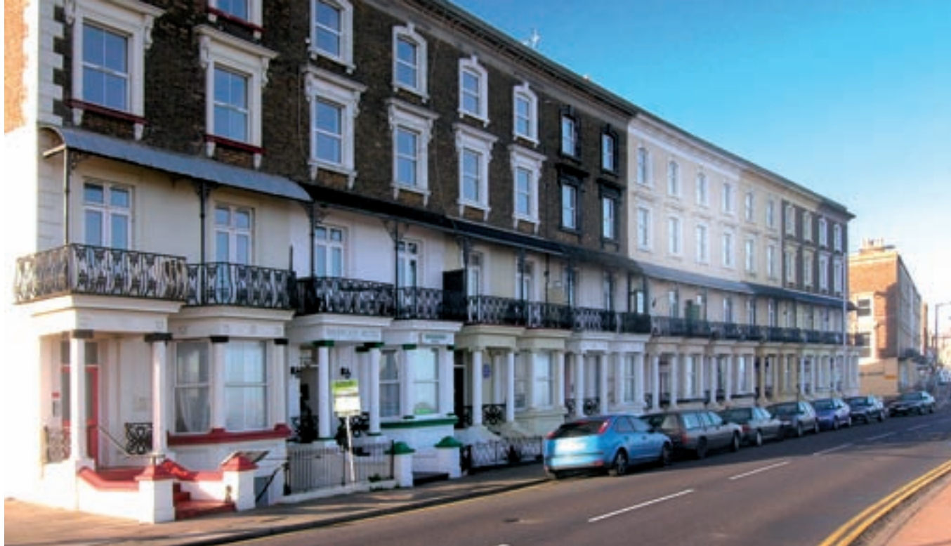
Figure 36 (above) Ethelbert Crescent and the now demolished Cliftonville Hotel were the new face of Margate in the 1860s, promoting the sophisticated Cliftonville area with its own beaches and promenades as a more sedate and classy alternative to boisterous central Margate. [DP023148]