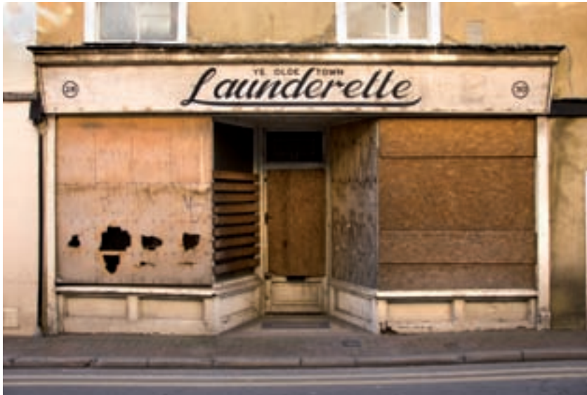
Figure 64 Ye Olde Town Launderette, King Street, provides a stark reminder of the vulnerability of historic buildings in areas suffering difficult economic circumstances. [DP032060]