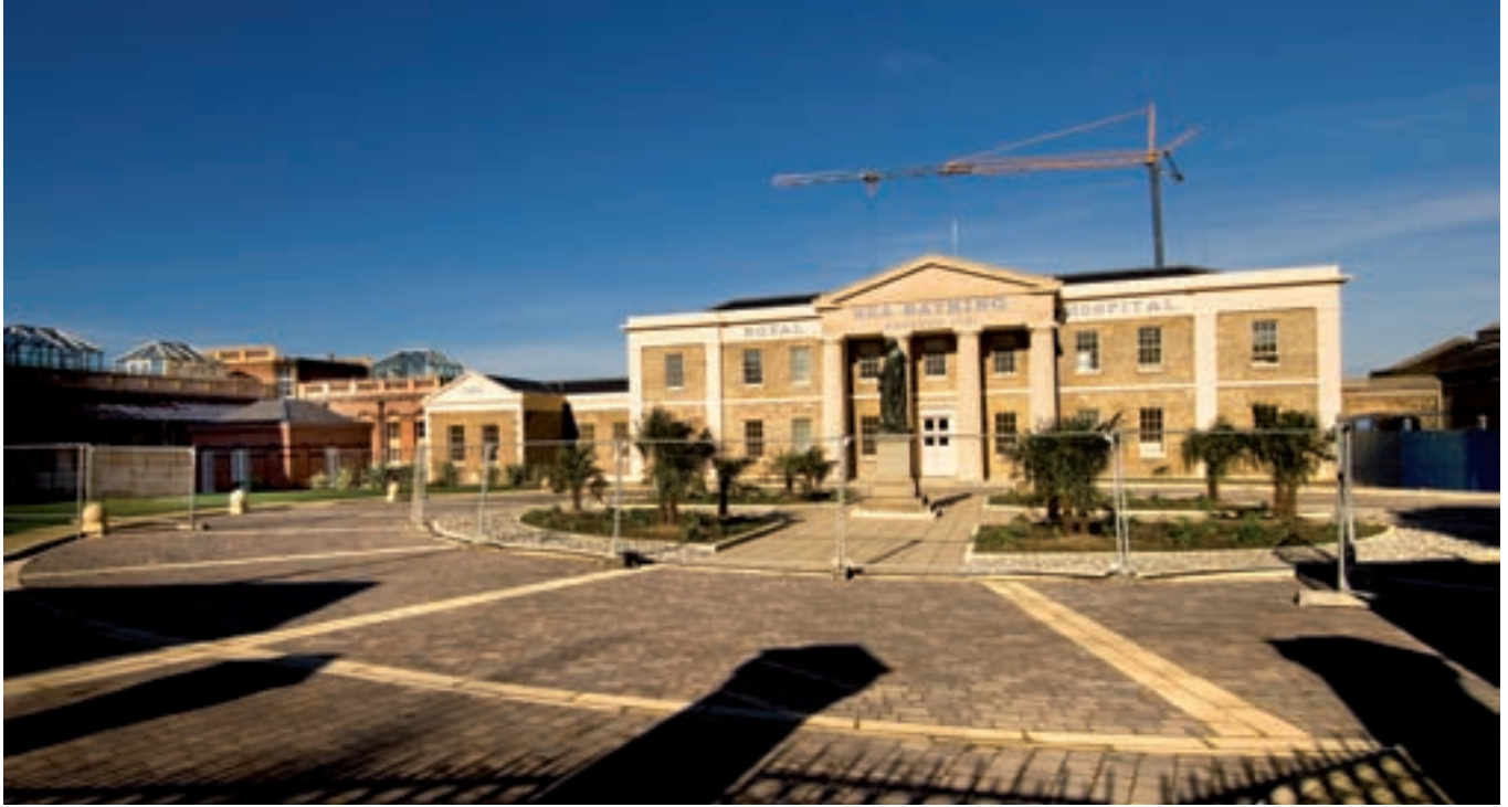
Figure 68 The Royal Sea Bathing Hospital is shown undergoing extensive redevelopment to convert the buildings into apartments. [DP032157]