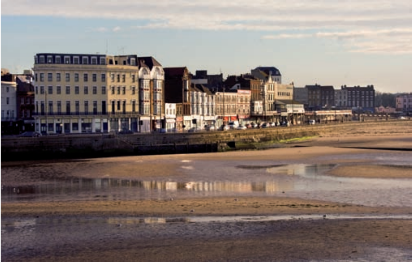
Figure 43 The construction of Marine Drive in 1878–80 completed the road along the seafront. The present buildings, many of which are now unoccupied, predominantly date from the late 19th and early 20th centuries. [DP032206]

Substantial investment in Margate's infrastructure during the second half of the 19th century enabled the town to keep pace with growing visitor numbers. In 1857, the Margate Waterworks Company opened a pumping station in Tivoli, and the waterworks were consistently updated during the next 50 years. The sewage system was improved around 1890, an event featured in guidebooks to boost public confidence in the town's healthiness. The sea walls were also strengthened and Marine Drive was created in 1878–80, but this reclamation on the new seafront isolated the bathing rooms on the High Street from the sea (Fig 43). Around 1900, a tramway was built along the seafront and through the town centre, connecting Margate with Broadstairs, Ramsgate, Westgate and Birchington. However, the most prominent Victorian addition to the town was the building of the Jetty, an iron successor to Jarvis's wooden