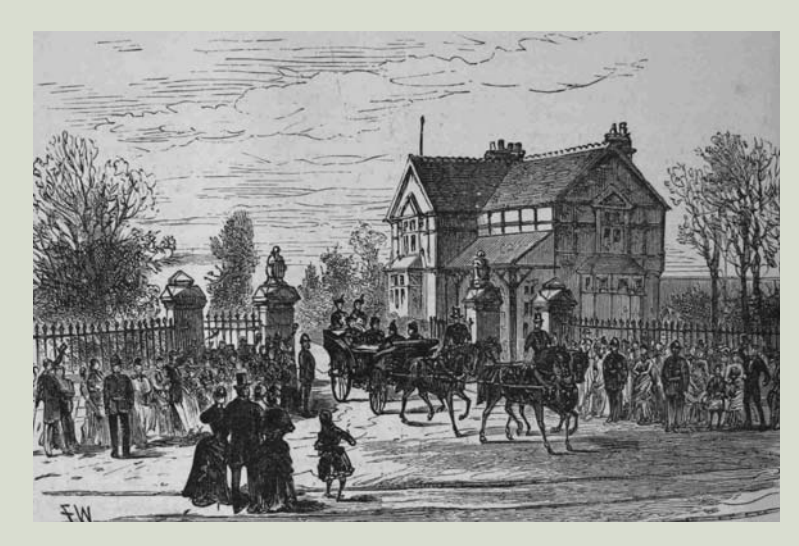
10 The Queen's visit to Small Heath Park, Birmingham, 1887.

Her Majesty, apparently to protect herself from the wind that was blowing strongly at the time she drove round the park, took shelter behind her 'sunshade', and as a consequence the children assembled on her right hand were unable to get a view of her features – a great disappointment to them.30