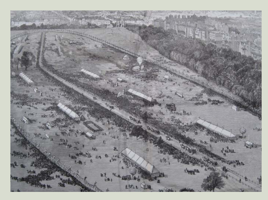
9 The Children's Jubilee, Hyde Park, 1887.

from Marble Arch to Grosvenor Gate was enclosed with Venetian masts, streamers and flags. Ten large tents were erected, staffed with waiters to serve the celebratory tea – a paper bag containing a meat pie, a square of 'jubilee cake', a bun and an orange, washed down with iced lemonade. After the tea, the children were released to enjoy the entertainments: