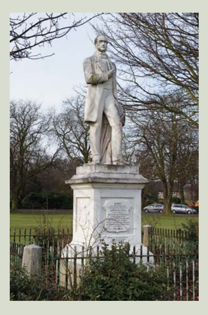
3 Statue of Prince Albert, Pearson Park. Hull, erected 1868.

but it is clear from historical evidence that even in the 19th century, they were contested and challenged.4