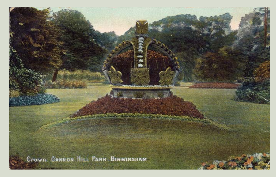
18 Floral crown, Cannon Hill Park, Birmingham.