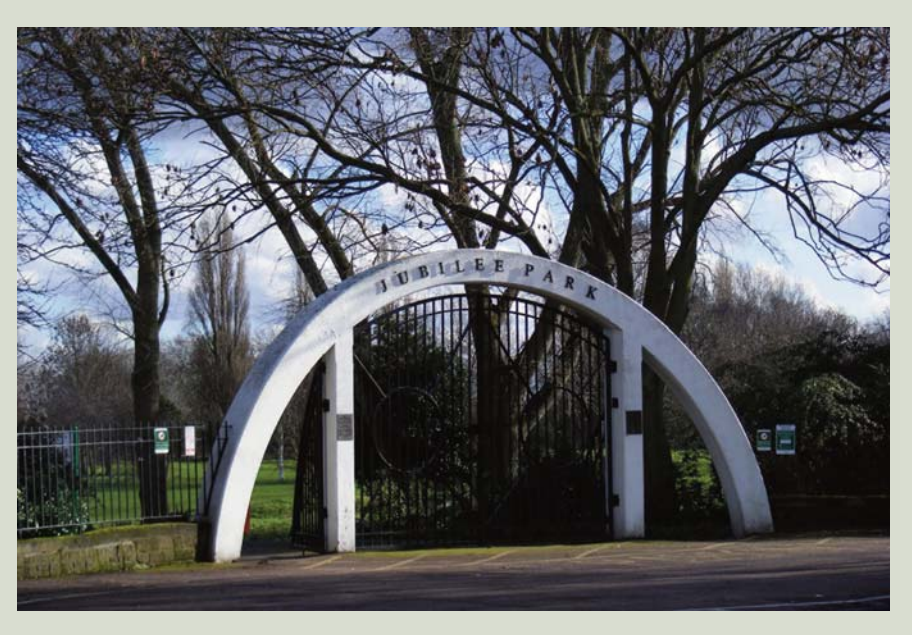
24 The entrance arch to Jubilee Park, Edmonton, London.

Jackson Park in Hartlepool a new shelter marked the 1935 jubilee, joining a bandstand and fountain that had been built to mark Queen Victoria's Diamond Jubilee.