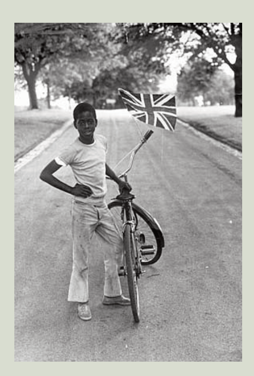
27 A boy in Handsworth Park at the time of the 1977 lubilee.

The Silver Jubilee Exhibition in Hyde Park, in a conscious echo of the 1851 Great Exhibition, was intended to demonstrate 'the scope and achievement of British industry and commerce', showcasing the work of thirty-one public and private sector companies selected for their significance in Britain's social and economic life (28). It was held in a huge marquee supplied by British Petroleum, which had used it at the inauguration of the Forties Oil Field in Aberdeen in 1975. The National Coal Board created an exhibit showing working conditions down a mine, with apprentices on hand to give first-hand accounts of the work; British Petroleum featured an igloo in which visitors were subjected to the temperatures they would experience in Alaska, complete with wind sound-effects to show working conditions during drilling operations in