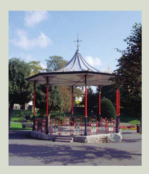
14 The Diamond Jubilee bandstand in Borough Gardens, Dorchester (see front cover), renovated in 2007 with the help of a grant from Heritage Lottery Fund.