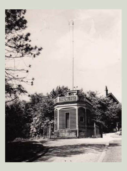
15 The observatory, Bold Venture Park, Darwen, erected 1897, rebuilt 1952 and demolished in the 1970s.

In Windsor Great Park, the 1887 Women's Jubilee Offering comprised a statue of Prince Albert, for which the Queen laid the foundation stone.<sup>49</sup> In Manchester, the statue of Victoria in Piccadilly Gardens was commissioned by the corporation's Jubilee Commemoration Fund in 1897 but only completed in 1901 after the Queen's death. The opening ceremony was characterised by significant disorder with dignitaries using chairs and a ladder to climb the garden railings to escape the crowd. The statue was much criticised – 'as a work of art it is bad, and as a work of patriotism it is futile' was one verdict - and in later years it was frequently vandalised while its steps became a venue for informal public meetings and speeches.<sup>50</sup>