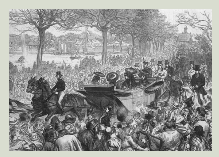
Queen Victoria to Victoria Park, London, 1873.