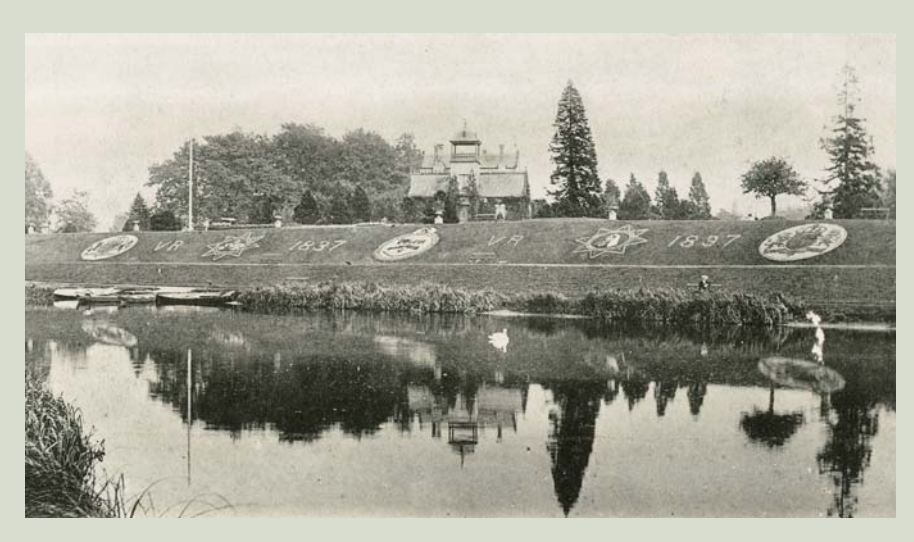
17 Commemorative bedding for the 1897 Diamond Jubilee, South Park, Darlington.

The jubilees were also an occasion for bedding displays (17). At Victoria Park in St Helens in 1897, the bed opposite the entrance, in which the name of the park was picked out in bedding, was supplemented with the words 'Diamond Jubilee', 'the letters being written in echeverias on a grounding of purple beet, bordered by pyrethrum'. 52 The crown planted at Cannon Hill Park in Birmingham is typical of the kind of displays that would have marked the jubilee celebrations (18). The Royal Horticultural Society established its Victoria Medal of Honour in 1897 'in perpetual remembrance of Her Majesty's glorious reign, and to enable the Council to confer honour on British horticulturists'. The award is restricted to 63 horticulturists at any one time, in commemoration of the 63 years of Queen Victoria's reign.