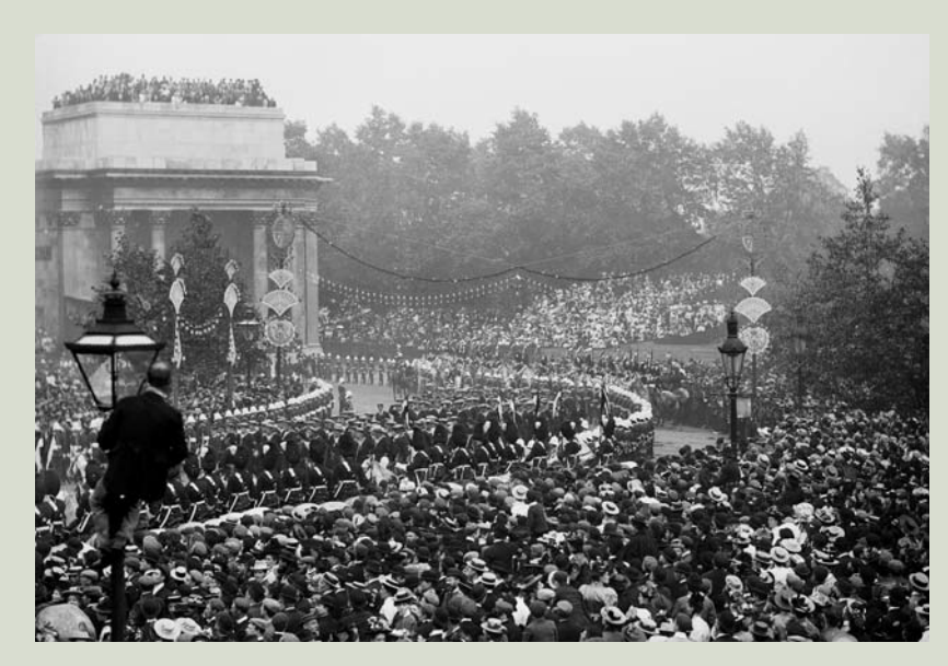
12 Crowds waiting for the 1897 Diamond Jubilee procession to pass the Wellington Arch, on the edge of Green Park, in London.