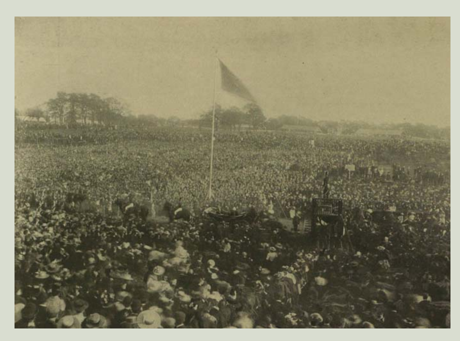
11 The Oueen's visit to Norfolk Park, Sheffield, 1897.

Ten years later in Salford, a parade of some 8000 ragged school and mission-room children wearing paper sashes and commemorative medals marched to the racecourse, to enjoy an afternoon of 'horizontal bar performances, conjuring and ventriloqual entertainments, and the grotesque balloons which were sent up at frequent intervals during the afternoon and evening'. 32 In May of the same year, the Queen visited Sheffield and included Norfolk Park on her visit. Reports of the event refer to more than 50,000 children assembled in the park (11).