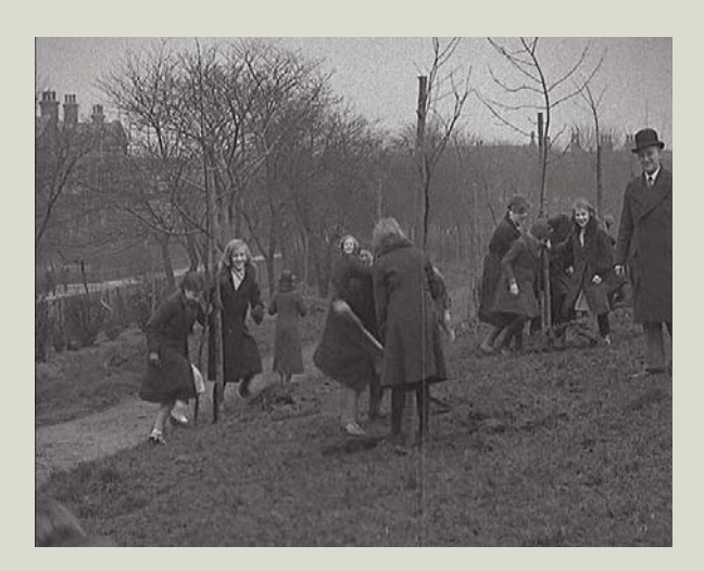
23 Children planting a jubilee avenue at Woodhouse Moor, Leeds, in 1935.