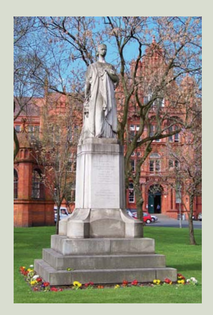
2 Statue of Queen Victoria, Peel Park, Salford, erected 1857.

Parks were intended to improve not only the health but the morals of their working-class users, offering not only lungs for the over-crowded cities, but valves to release pressure which might otherwise lead to social unrest. Encomiums in sculptural inscriptions encouraged the civic virtues of temperance, obedience, duty and patriotism, while bye-laws prohibited behaviour considered vicious. That these rules outlawed such seemingly innocent activities as dancing, smoking, or eating may seem quaint now,