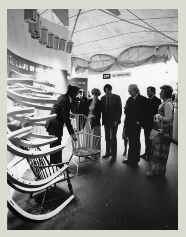
28 Interior of the Hyde Park Silver Jubilee exhibition tent. 1977.

The Royal Institute of Chartered Surveyors took charge of arrangements for a network of jubilee beacons, including one on Snow Hill in Windsor