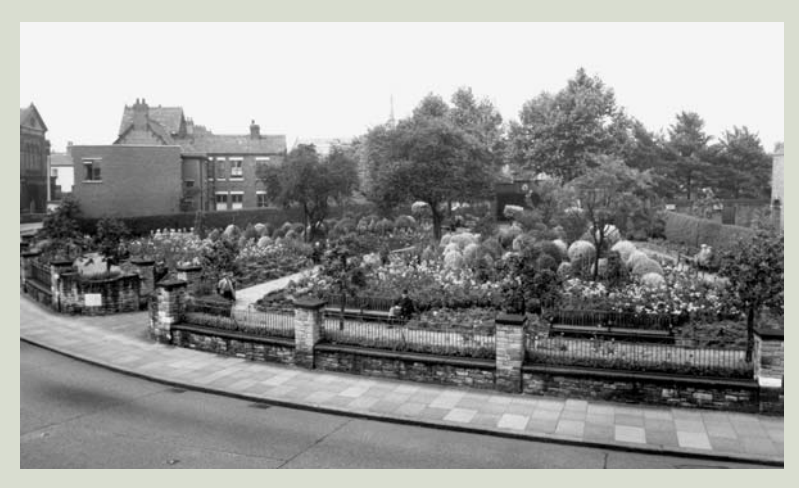
25 Jubilee Gardens, Crewe, laid out to celebrate George V's 1935 silver jubilee.