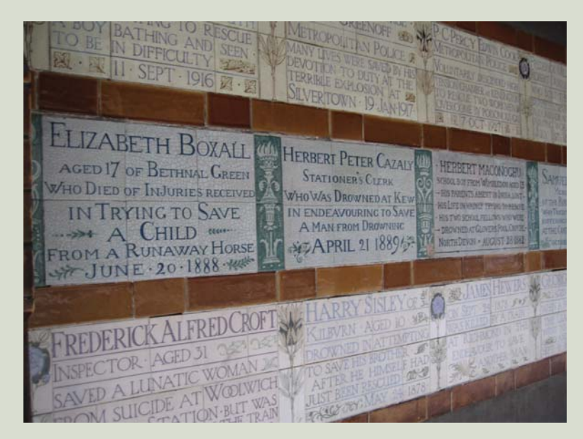
19 The commemorative tiles in the loggia, Postman's Park, London.

Watts's original idea was for a 'kind of Campo Santo' with a marble wall of inscriptions in Hyde Park. It was not taken up but in 1898 it was revived by the promoters of a new park beside St Botolph's church in the City of London. The Metropolitan Public Gardens Association was struggling to save the former churchyard from development – Octavia Hill had donated £1000 – and the vicar approached Watts about his scheme. A reduced version of his proposal was agreed and work began in 1899, with the selection of the texts based on cuttings collected by Watts over many years. The work was delegated to a Heroic Self-Sacrifice Memorial Committee, employing William de Morgan, a friend of Watts, to design the tiles (19). After Watts's death in 1904, the work continued under the leadership of his wife Mary but after her death in 1938 the project was left incomplete.53