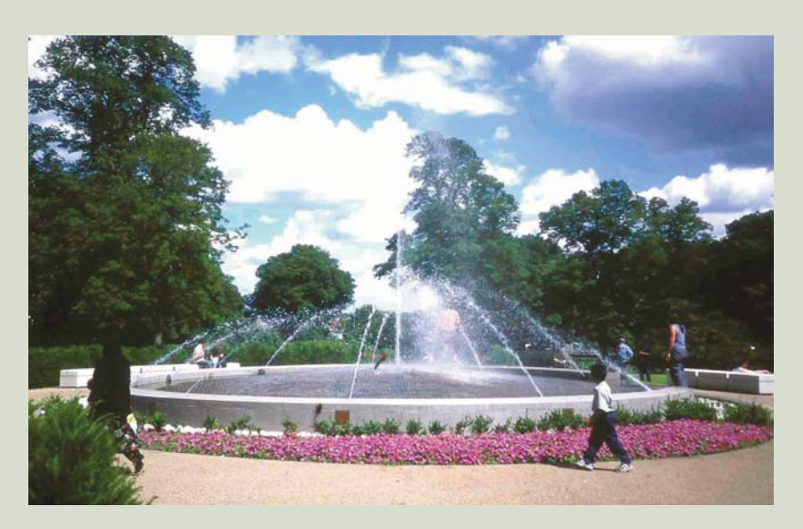
31 The Queen Elizabeth II Peace Fountain, Southampton Central Park, opened as part of the 2002 Golden Jubilee celebrations.

The Golden Jubilee celebrations in 2002 took place in slightly happier times for public parks and gardens. Many older parks had been restored by the Heritage Lottery Fund, or used Lottery funds to stage events, create memorials or even lay out new parks. The restoration of Central Parks in Southampton was crowned in 2002 by a new Queen's Peace Fountain as part of the jubilee celebrations (31), and a new Jubilee Garden was established at Mount Edgcumbe Country Park, Plymouth, in the same year. At Cedars Park, created in the early 19th century around the site of the former royal palace at Theobalds in Hertfordshire,