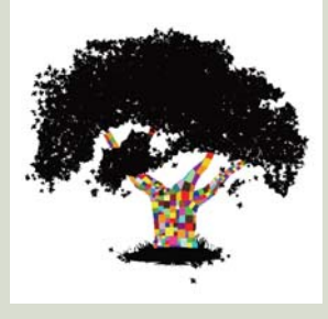
26 Jubilee Gardens, Crewe: volunteers knitting for the 2012 diamond jubilee 'Tree Cozy' community art project. © Artyarn