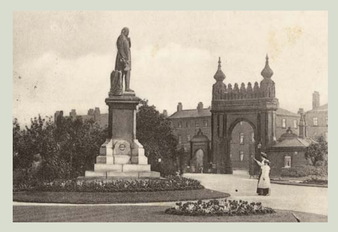
7 The Victoria arch. Peel Park. Salford, erected 1857, demolished 1937.

Visits by royalty were often marked by the erection of statues and architectural features, or the planting of a commemorative tree. At Salford, a marble statue was erected to mark the 1851 visit; her next in 1857 resulted in the erection of the Victoria Arch, an extraordinary structure in a style 'copied from designs of Indian architecture', which was demolished in 1936 (7), and finally a statue of Albert was erected after his death in 1861. 14 At High Beach in Epping Forest, an oak was planted in 1882 on the occasion of the Queen's visit, when