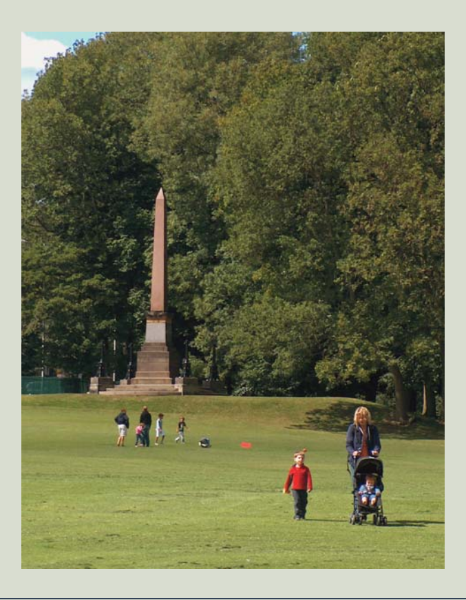
16 The obelisk. Endcliffe Park. Sheffield, originally erected in Fargate to commemorate the 1887 Golden Jubilee but relocated to the park in 1905.

Not all the jubilee monuments now in public parks were first erected there. Parks have often been the repository for items of public art which have outlived their original location. At Endcliffe Park in Sheffield, the 1887 jubilee obelisk in the park originally stood in Fargate, and was moved to the park in 1905 to make way for the very fine statue of Victoria flanked by heroic figures of Labour and Maternity that was erected on her death (16). This in turn was also moved to the park, in 1930. The monument to the jubilee opening of the park is a more unconventional object, formed from rough stones to resemble a dolmen, inscribed and dated 1887.