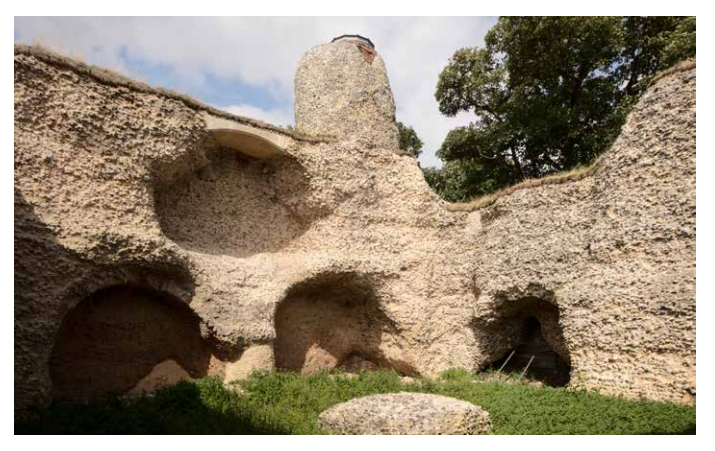
Stabilised remains of the keep, Walden Castle, Saffron Walden

Thank you to everyone who has helped reduce the overall amount of heritage at risk in England – we look forward to reporting further progress next year.