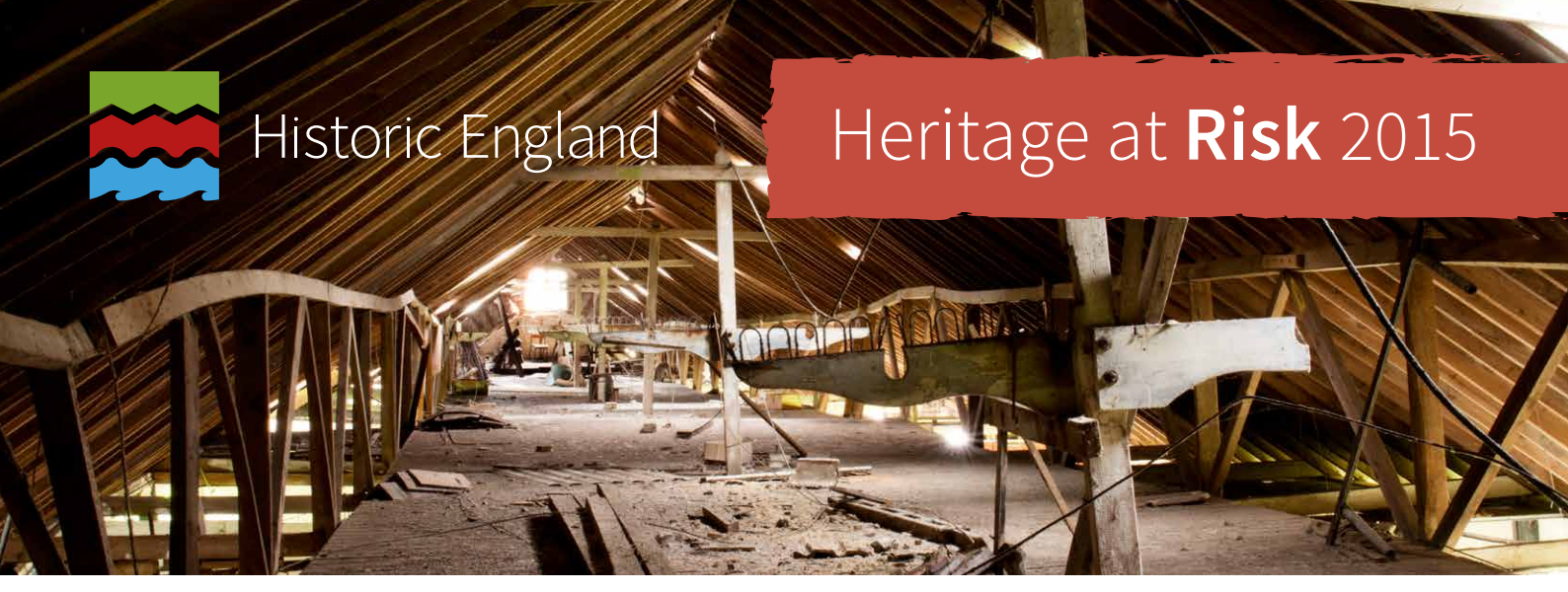
The east Rope Walk, at Job Gould's west of England Twine Works, West Coker

For the first time, we've compared all sites on the Heritage at Risk Register – from houses to hillforts – to help us better understand which types of site are most commonly at risk. There are things that make each region special, from the coastal defence sites in the South East to the wind and water mills in the East of England that, once gone, will mean a sense that region's character is lost too. Our local Heritage at Risk teams strive, with support from owners, funders and others, to find solutions for these sites.