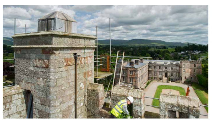
The Keep, Appleby Castle, Eden

Through advising funders on which sites are most at risk, and directing our own grant aid where other funders cannot, we will continue to reduce heritage at risk.