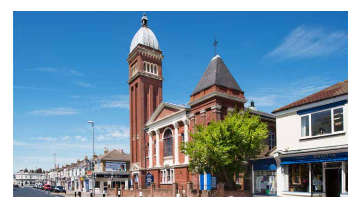
Holy Trinity Methodist Church, Portsmouth

Despite over a 100 places of worship being removed from the