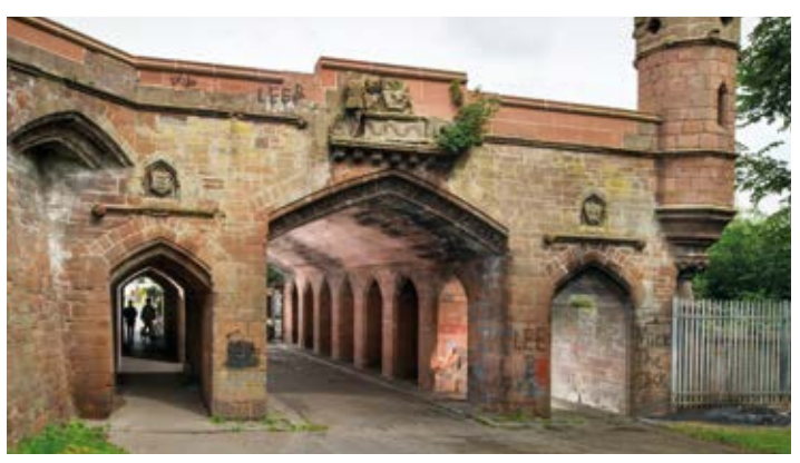
Anfield Cemetery, Liverpool

at risk expertise and encouraging local authorities, volunteers and building owners across the country to come together to record the condition of grade II buildings. This information will be collected using a nationally consistent approach to help local planning authorities identify those buildings most at risk. English Heritage will use the information collected to build a national picture to identify trends so we understand the issues facing all historic buildings.