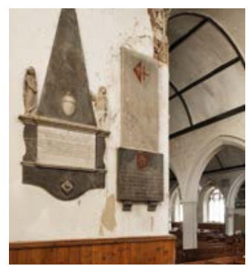
Church of St Thomas the Apostle, Exeter