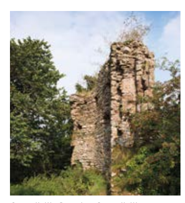
Snodhill Castle, Snodhill, Herefordshire