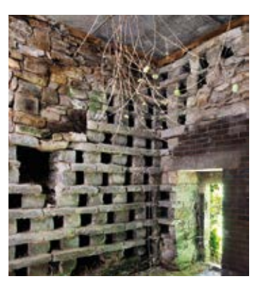
Alvecote Priory Dovecote, Shuttington, Warwickshire