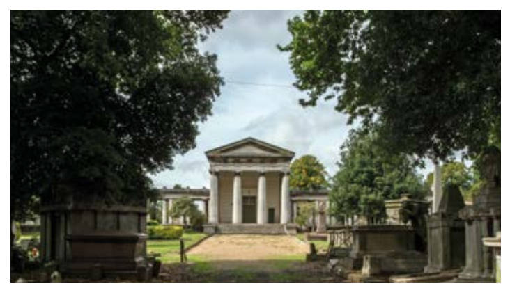
Kensal Green (All Souls) Cemetery, Kensington and Chelsea