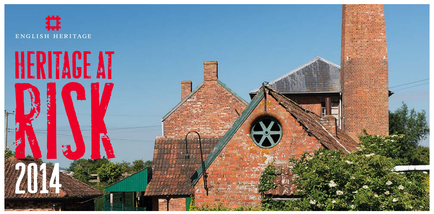
Westonzoyland Pumping Station, Sedgemoor, Somerset

Over the past year we have focused much of our effort on assessing listed Places of Worship, visiting those considered to be in poor or very bad condition as a result of local reports. We now know that of the 14,775 listed places of worship in England, 6% (888) are at risk and as such are included on this year's Register. These additions mean the overall number of sites on the Register has increased to 5,753. However, 575 sites have been removed from the 2013 Register.