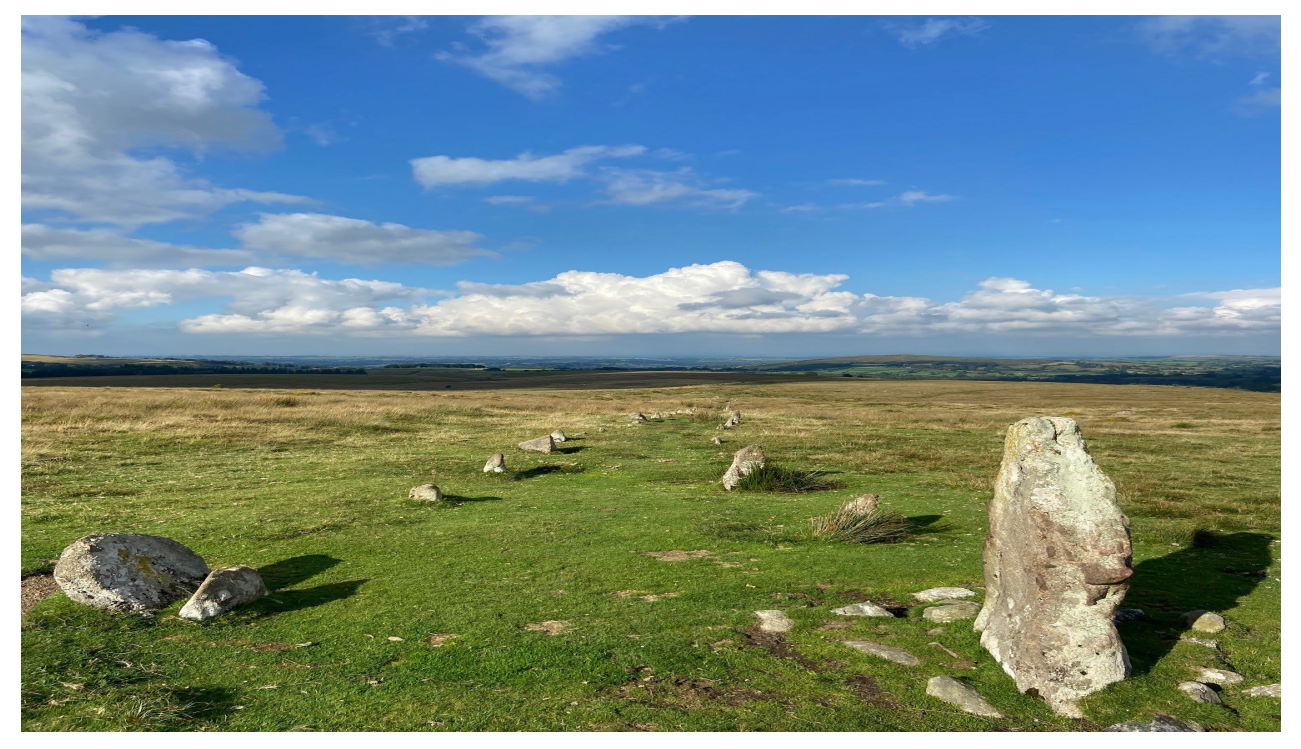
Hurston Ridge Double Stone Row, Dartmoor, Devon

From 1 August 2013, the exemption for supplies of research between eligible bodies (universities and local authorities) was withdrawn. This change will mostly affect projects funded as a result of a tender process and will mean that if your organisation has a VAT-able arm you will be required to charge VAT. If you are VAT registered it is your responsibility to ensure the correct rate of tax is applied to your project costs. You should check your VAT status before submitting your PD, and if necessary, discuss this with us.