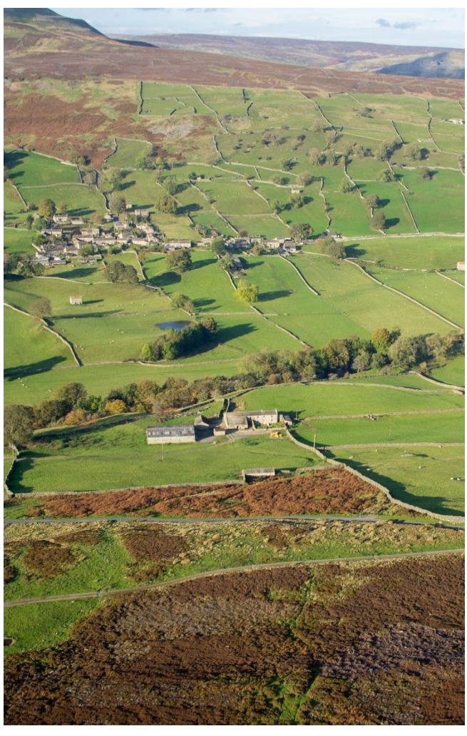
Historic farm buildings and field barns, Yorkshire Dales