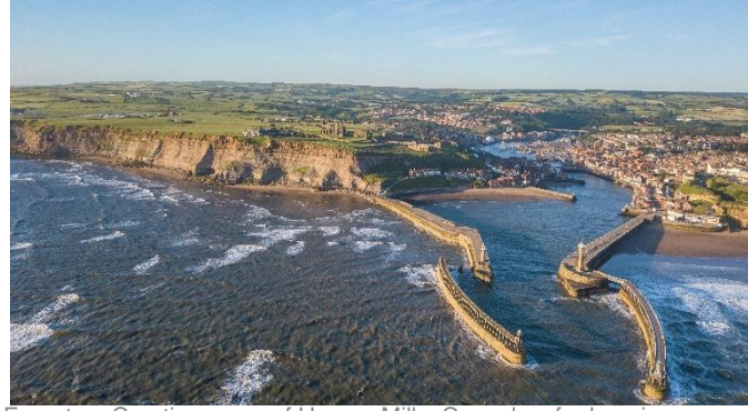
From top: Creative reuse of Horace Mills, Cononley, for housing; Ribblehead Viaduct; oblique aerial view of Whitby from the east.