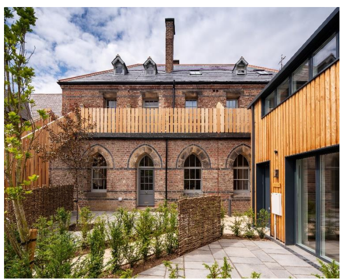
Creative re-use of historic buildings for residential use: former St. Joseph's Convent, York.