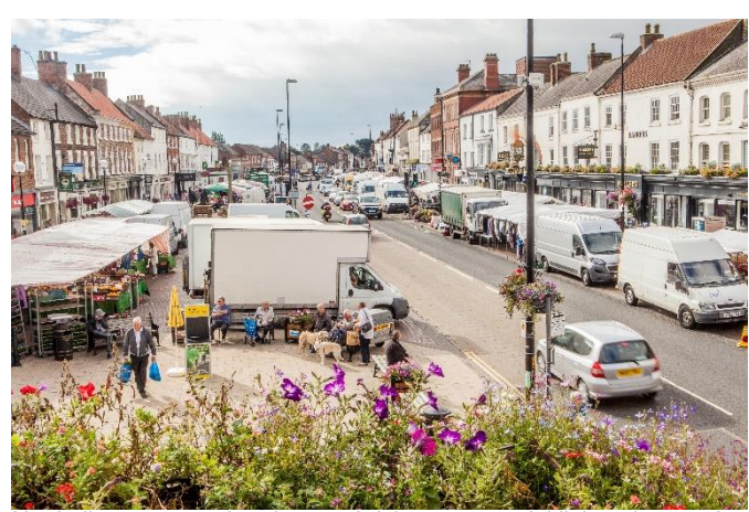
Northallerton on market day – a thriving commercial link to the town's history and development.