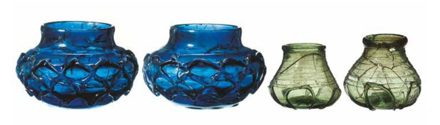
Glass vessels from the Prittlewell Anglo-Saxon grave.

These few examples, chosen from many, show how archaeology on development sites is highlighting the skills and ambitions of people in the past. New construction work to meet the complex demands of modern life is also showing us how sophisticated our forebears were.