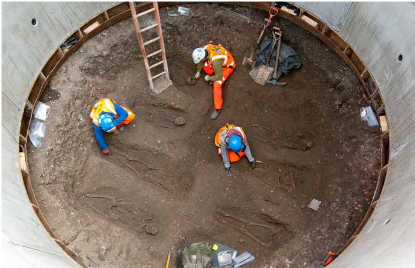
Top: A Medieval lead seal of Pope Nicholas V, Whitefriars, Canterbury. Bottom: Graves of Black Death victims, found deep in a shaft dug for London Crossrail.