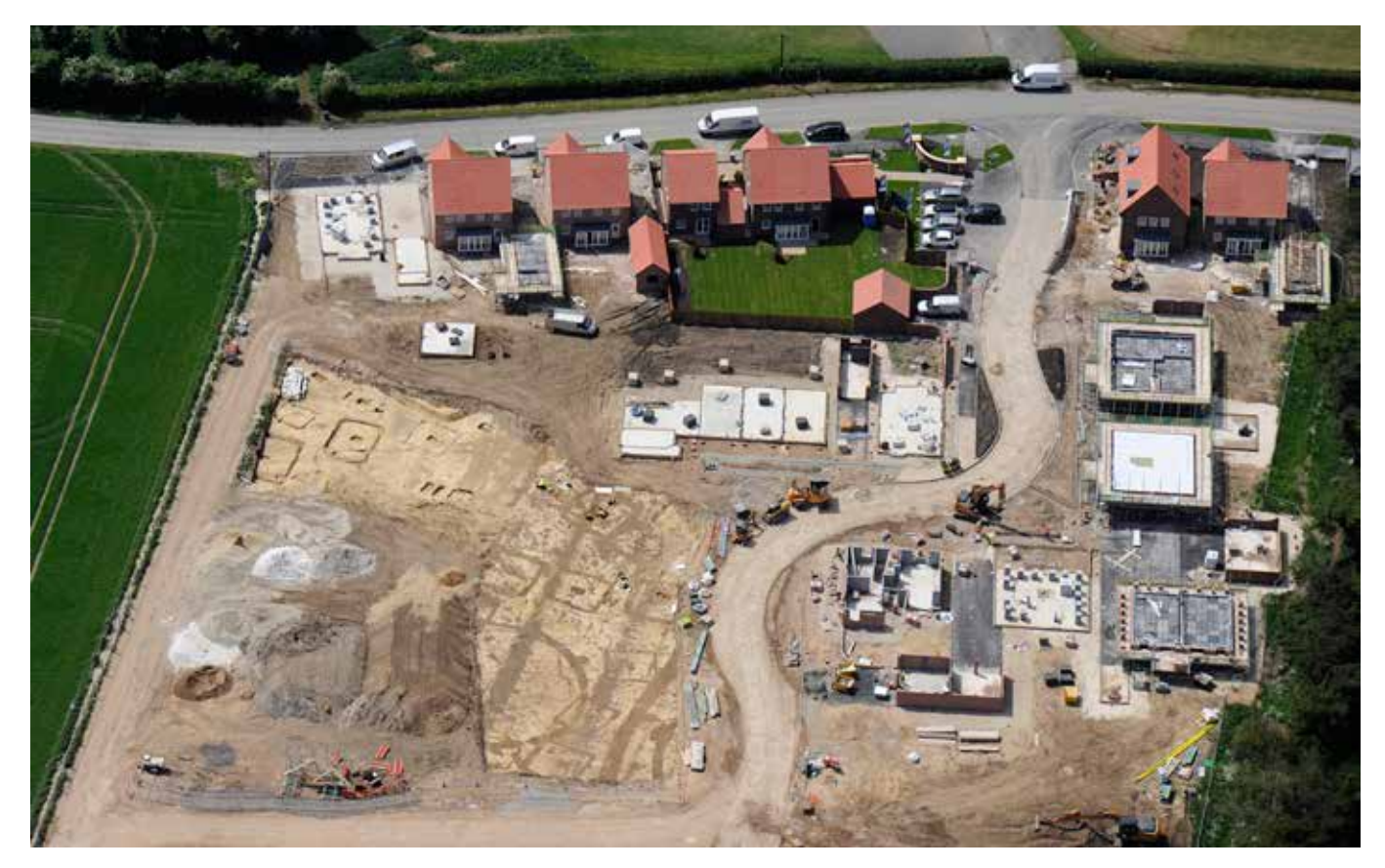
Excavation on a housing site at Pocklington, East Riding of Yorkshire, revealed Iron Age graves inside small square enclosures.

Sustainable new development will continue to take place: it is in the national interest that it should. We cannot predict exactly what archaeological advances will result from future schemes, but they will certainly be many and exciting. England's heritage is central to our identity as a vibrant, modern society, and development-led archaeology is making a rich contribution to our cultural life. This is something of which we can all indeed be proud.