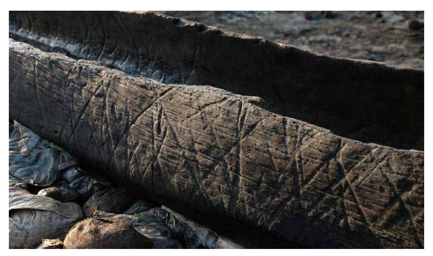
A decorated prehistoric wooden canoe from Must Farm.

of nearly 200 sacrificed cattle were deposited at his tomb. The cattle may have come from a number of different areas, perhaps suggesting commemoration of a widely-famed person.