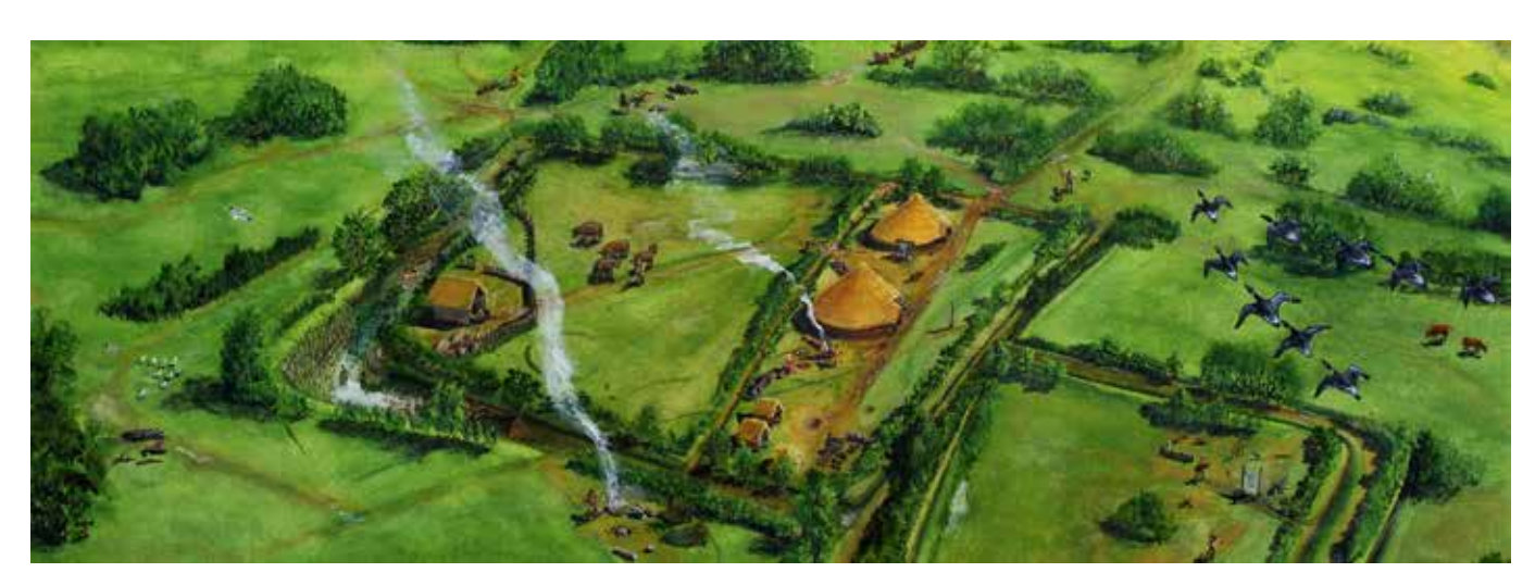
Farmsteads\ like\ this\ one\ excavated\ at\ lwade\ in\ Kent\ were\ common\ in\ Iron\ Age\ England.

As the centuries passed, established farms with fields enclosed by ditches became more frequent. In the Iron Age (about 700 BC onwards) there seems to have been a population explosion.