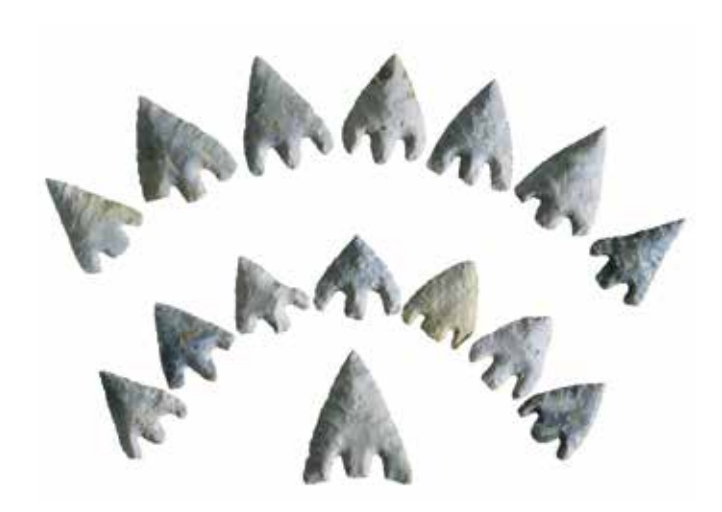
The grave of the Amesbury archer contained over 100 objects.

The man had been buried with over 100 objects, including fine pots, copper knives, stone wristguards, gold ornaments, and 18 flint arrowheads – hence his name. The grave is one of the richest of its kind ever found.