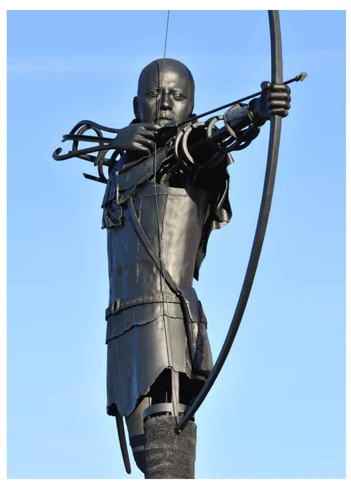
Modern sculpture of the prehistoric archer whose grave was found at Amesbury, Wiltshire.