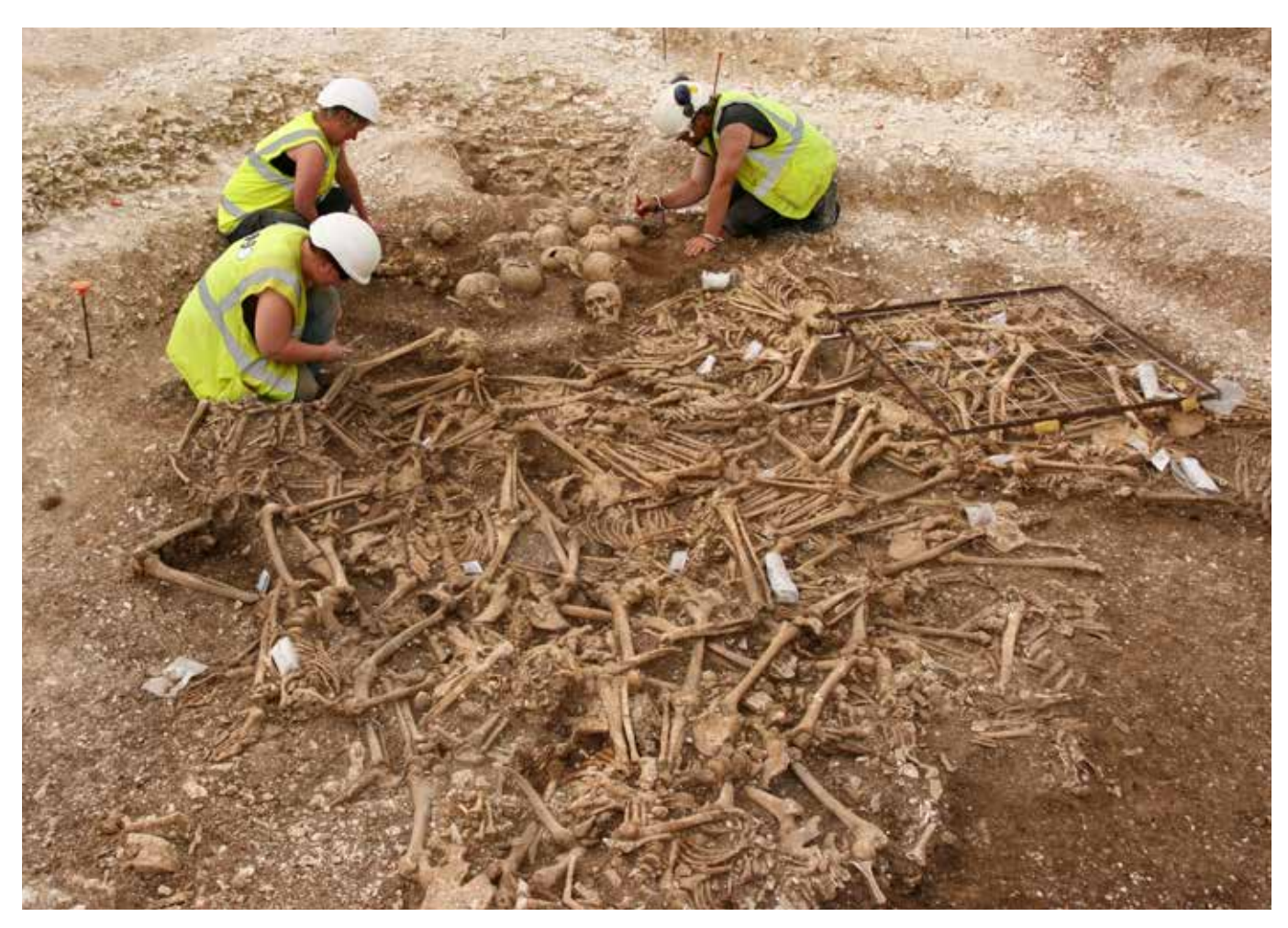
Mass grave of decapitated Viking men, found on the Weymouth Relief Road.

Anglo-Saxon cemeteries are very distinctive, with bodies or cremations often accompanied by pottery, brooches, weapons and other items. These sites are a rich source of information about communities in post-Roman England. At Saltwood in Kent, three such cemeteries containing a total of over 200 graves were found and excavated when the High Speed 1 railway was being built to link London to the Channel Tunnel. Some of the burials occurred after AD 597, when St Augustine brought