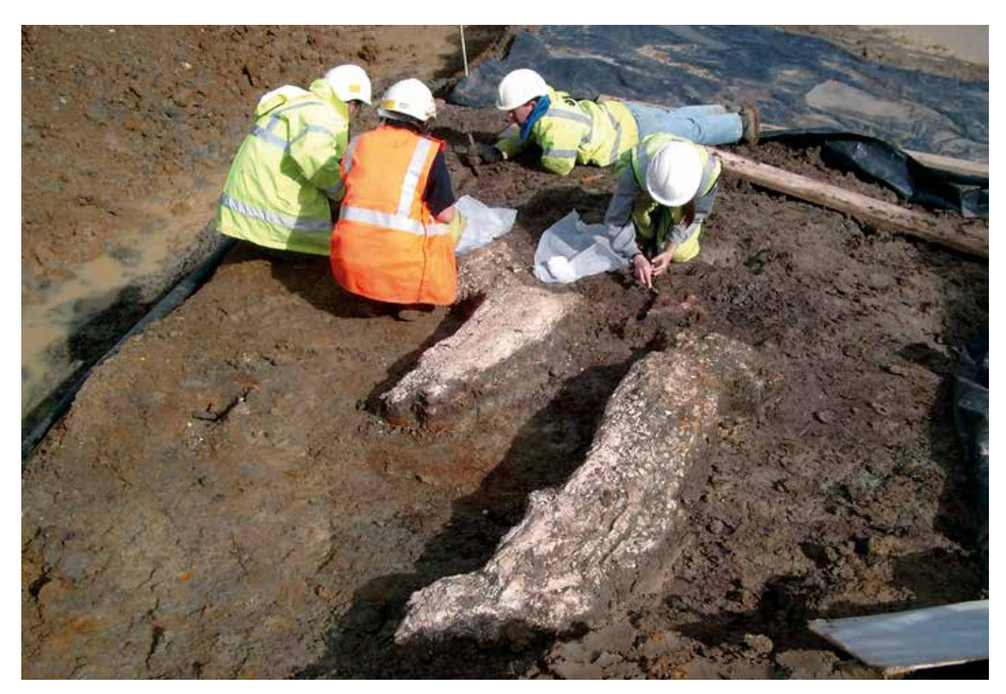
Excavating the tusks of the Ebbsfleet prehistoric elephant.

documentation, archaeology can add important information. Written history gives us one perspective: archaeology can often tell us much more about everyday lives. For every period of our history, development-led archaeology is proving to be a hugely important source of new and sometimes surprising stories.