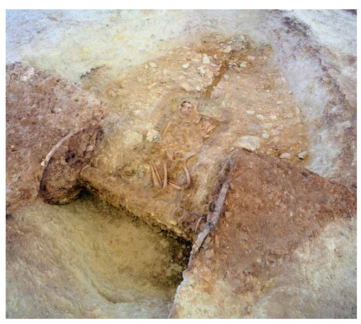
The Holmfield Iron Age chariot burial: the skeleton of a man lies between the wheels of a chariot buried in a large pit.

In 2003 a grave was found during archaeological fieldwork commissioned by the Highways Agency in advance of roadworks at the Holmfield Interchange, West Yorkshire. Around 200 BC a man's body was laid in a pit large enough to take his complete chariot, equipped with sophisticated iron tyres. Chemical analysis suggested that the man came from Scotland. Much later, the remains