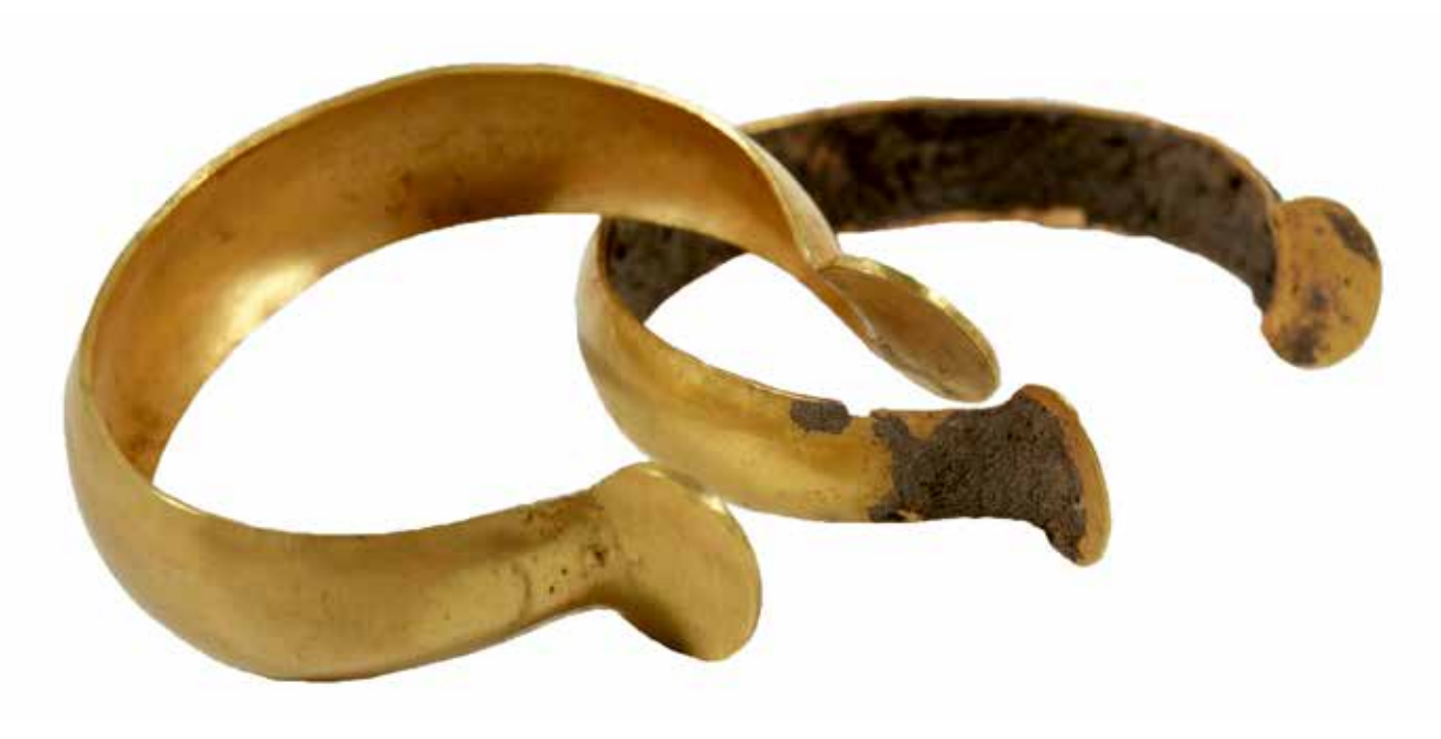
Bronze Age gold bracelets found on the East Kent Access Road.

Excavations in a gravel quarry run by Pioneer Aggregates at Wollaston, Northamptonshire, revealed Roman furrows of a type described by Classical writers for growing vines; grape pollen was found in the soil. The Wollaston vineyards,