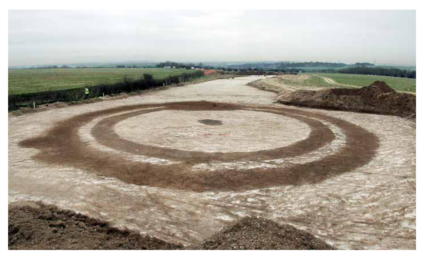
The site of an early Bronze Age round barrow with a central grave, Thanet, Kent.

Great changes in agriculture and society also took place at this time. In parts of England, around 1500 BC large areas of land were divided up into blocks of rectangular fields, crossed by trackways linking scattered farmsteads. One such landscape was explored in detail on the site of Heathrow Airport Terminal 5. The scale of the excavations gave a remarkably full picture of Bronze Age farming communities in a well populated and carefully managed countryside.