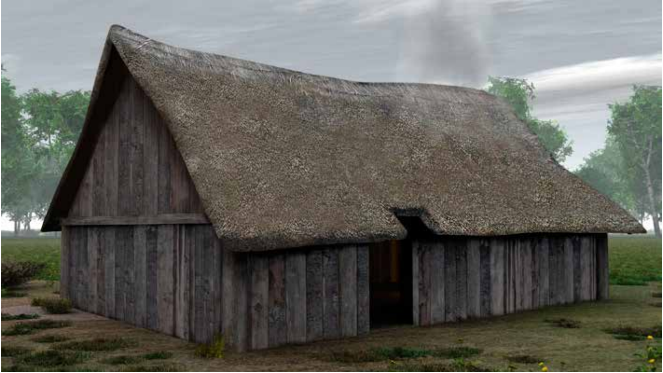
Kingsmead Quarry, Horton Top: Archaeologists stand around the foundation of a Neolithic house. Bottom: How the house may have looked.