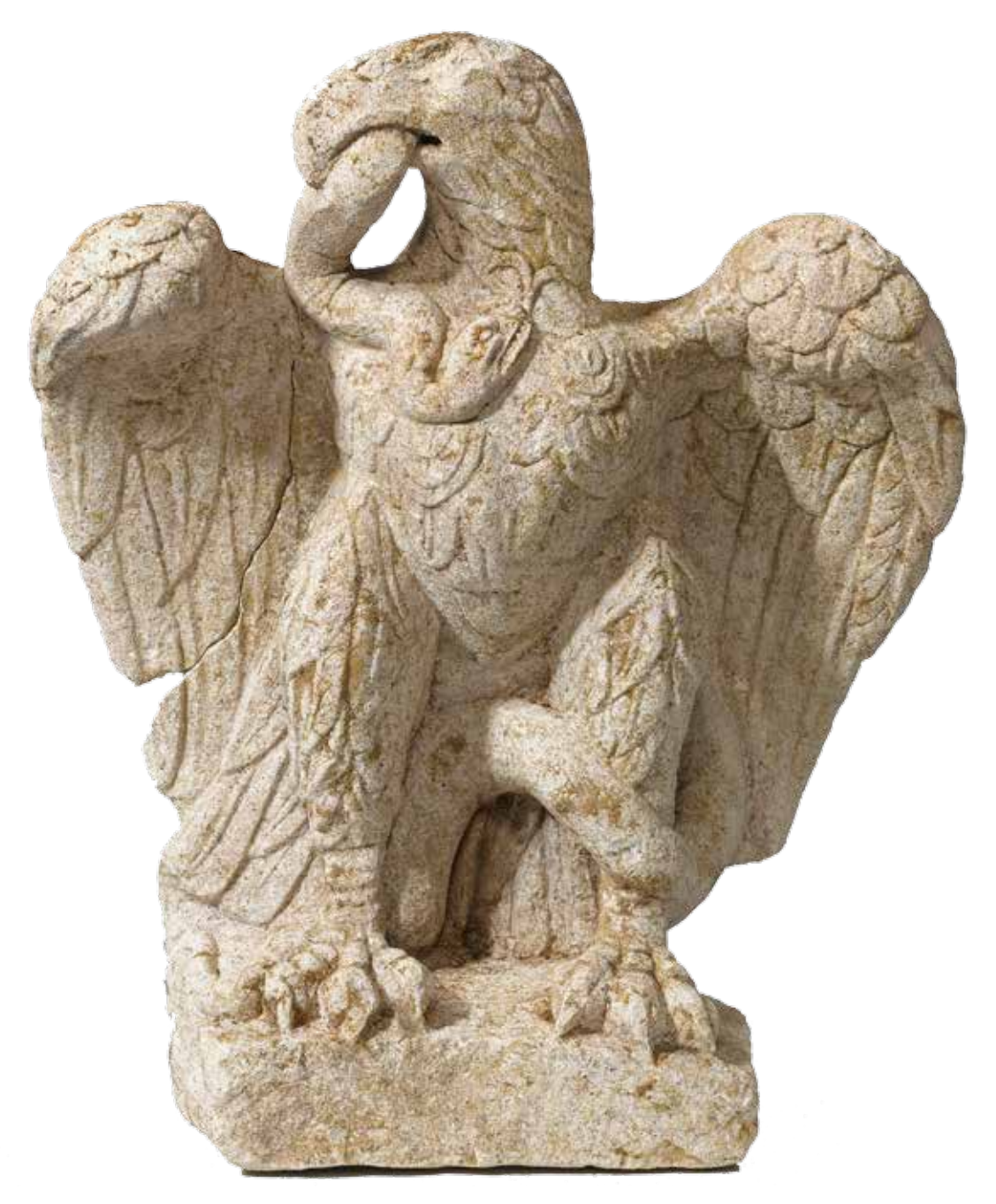
The eagle and serpent sculpture from the Minories, City of London.

This project makes Britain one of the bestunderstood provinces in the Roman Empire: there has been no other such systematic study based on so much new information. This is another example of how the gradual accumulation of development-led results is allowing new national histories to be written.