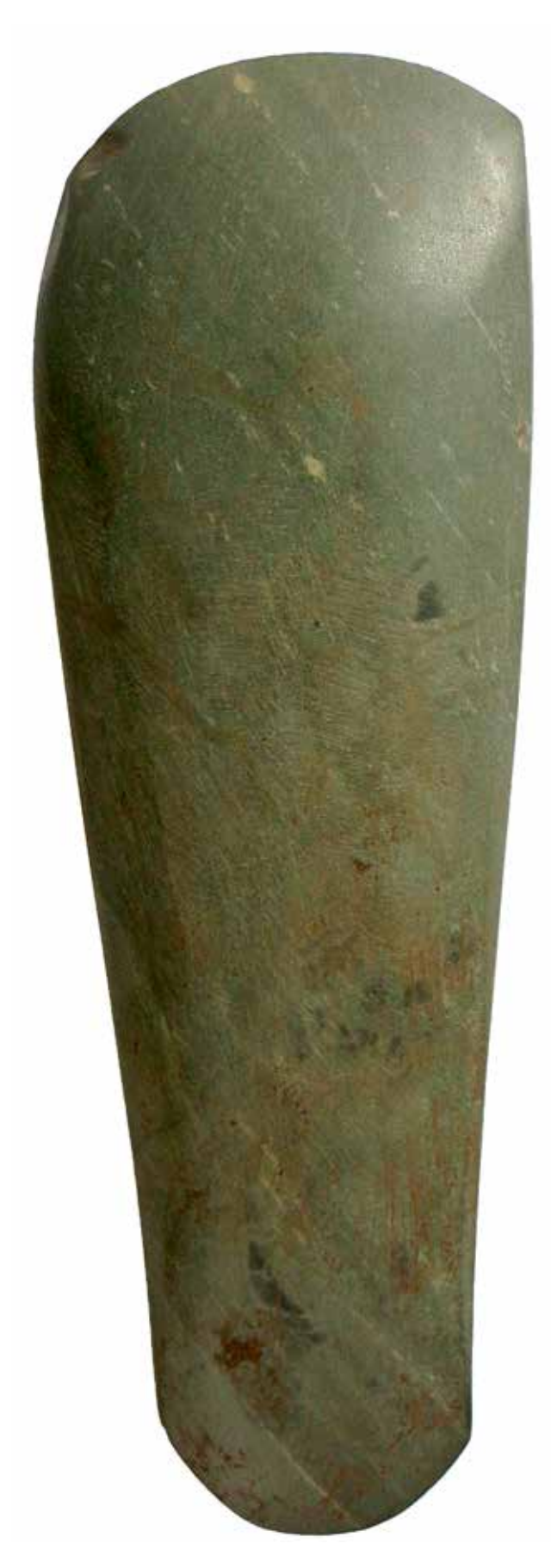
Neolithic polished stone axe from Stainton, Cumbria.

Material from Neolithic enclosures has been subjected to a major programme of radiocarbon dating – the largest of its kind in the world – funded by English Heritage (now Historic England) and the Arts & Humanities Research Council.