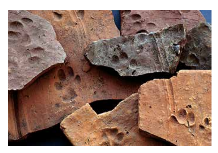
Animals walked on these Roman clay tiles before they were fired. Wainscott, Kent.

In Roman times Leicester was the capital of a Midlands tribe, the Corieltauvi. On the site of the city's new Highcross shopping centre, finds included a 'curse tablet'. These are lead sheets