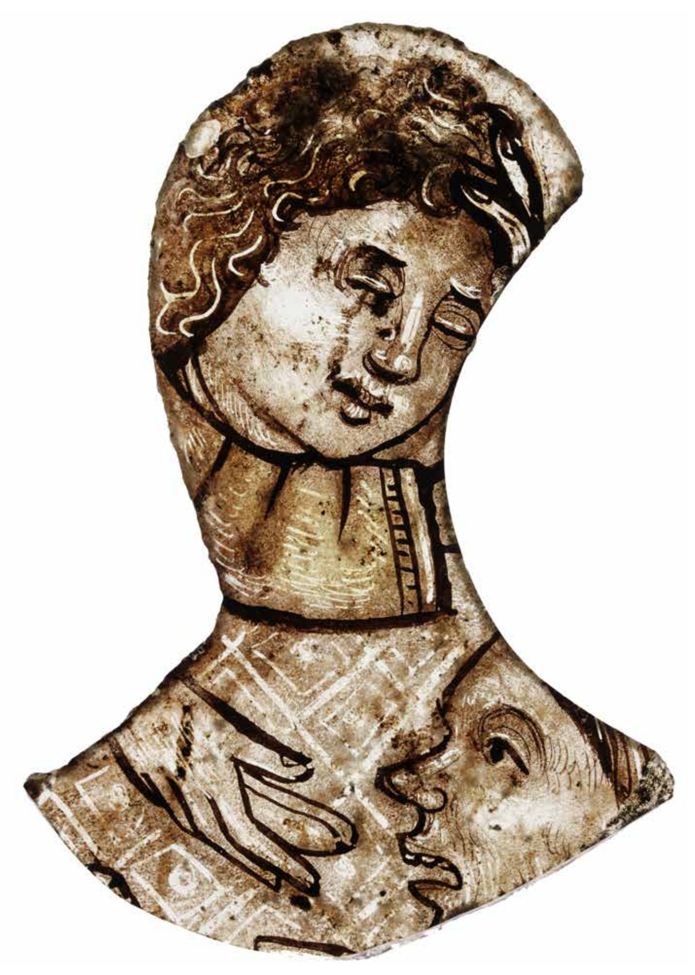
Medieval\ stained\ glass, showing\ the\ last\ rites, from\ the\ site\ of\ Whitefriars\ church,\ Canterbury.\ ©\ Canterbury\ Archaeological\ Trust.