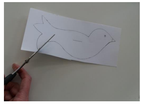
1 Cut out the dove shape on card or thick paper (see template).