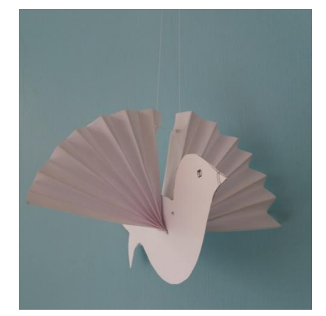
12. Suspend several doves with different lengths of cotton to create a classroom display.