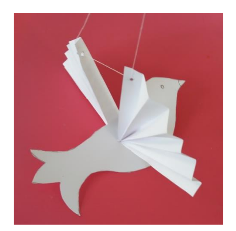
11. Tie the 2 ends of cotton together