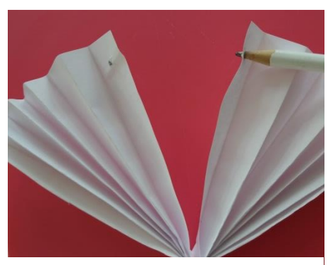
7. Pierce the dots with a sharp pencil to make holes.