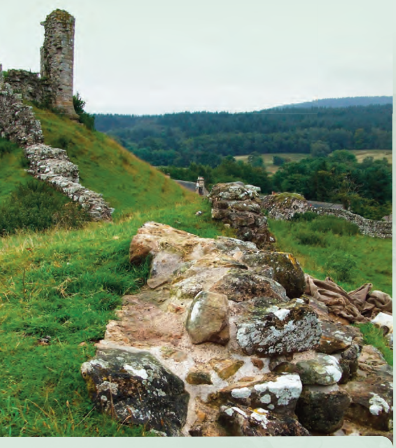
Harbottle Castle, Northumberland National Park

National Park Authorities also have a strong record of providing high-quality training and delivering apprenticeships, and have been involved in the design and development of several Trailblazer Apprenticeships, from historic environment investigation to traditional countryside management.